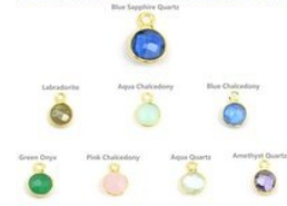
925 STERLING SILVER ROUND SHAPE GEMSTONE BEZEL CONNECTOR

925 Sterling Silver 7X10 MM Round Bezel Connector Weight 0.35 Gram @ Piece