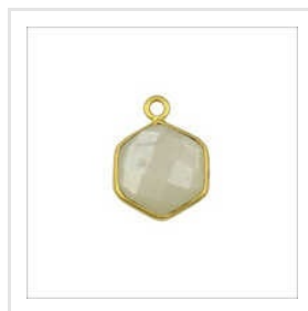
Multi Gemstone Hexagon Shape Bezel