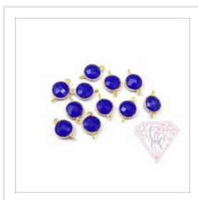
Blue Chalcedony Bezel Connector