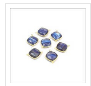
Semi Precious Bezel Connectors