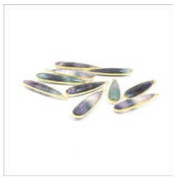
FLUORITE GEMSTONE BEZEL CONNECTOR

12X16 MM Natural Gemstone With 18K Gold Plated Handmade Fashionable Adjustable Bangle, 18K Gold Filled Pearl Handmade Adjustable Beaded Rosary Chain Bracelet, 18K Gold Filled Pearl Handmade Chain Necklace, 18K Gold Filled Pearl Handmade Round Shape Chain Necklace, etc.