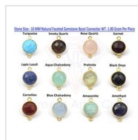
18K Gold Plated Natural Gemstone Handmade