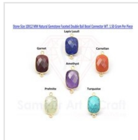
Stone Size 10X12 MM Natural Gemstone 18K Natural Gemstone 18K