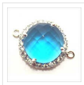
Blue Topaz Bezel Connector