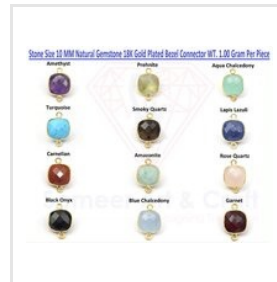
Cushion Shape Natural Gemstone 18K Gold