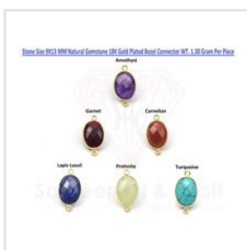
18K Gold Plated Natural Gemstone Oval Shape