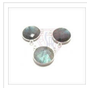
Labradorite Gemstone Bezel Connector