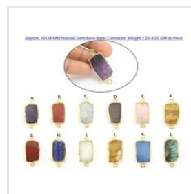
Natural Gemstone Electroplated Gold