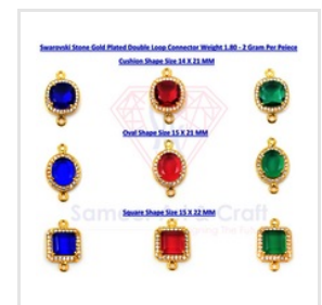
Swarovski Stone Gold Plated Double Loop