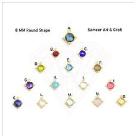
Multi Gemstone Round Shape Beze Connector