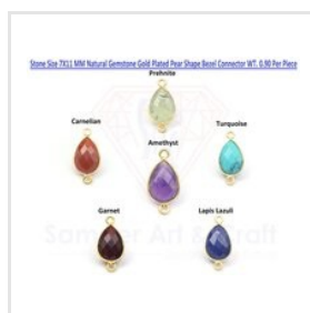
Natural Gemstone With 18K Gold Plated