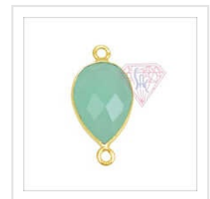
Pear Shape Gemstone Bezel Connector