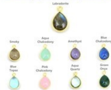
925 STERLING SILVER DROP SHAPE GEMSTONE BEZEL CONNECTOR

10X15 MM Drop Shape Bezel Connector Weight 0.90 Gram @ Piece