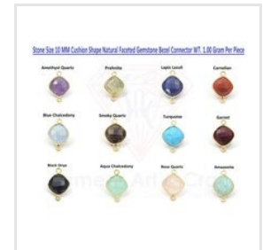
Natural Gemstone Cushion Shape 18K