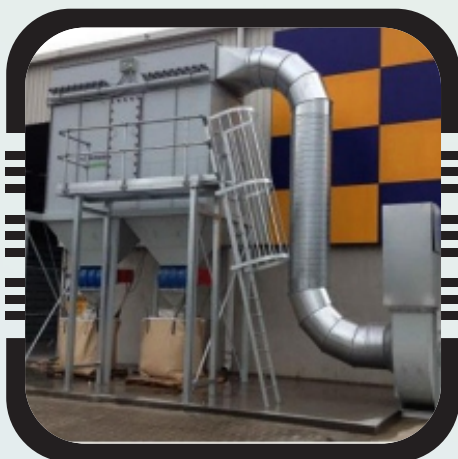
Dust Control Equipment