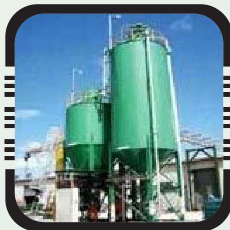
Pneumatic Conveying System