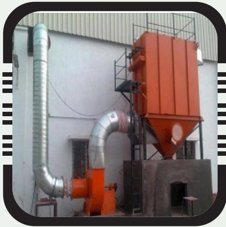
Bag Filter Systems