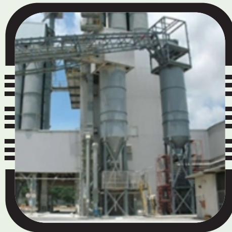
Dilute Phase Pressure Conveying System