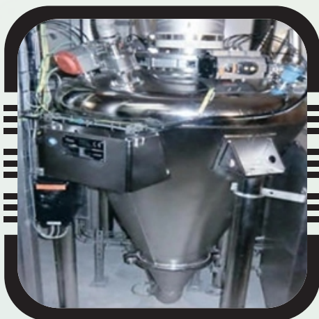
Pressure Conveying System