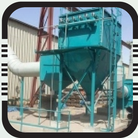
Dust Collection System