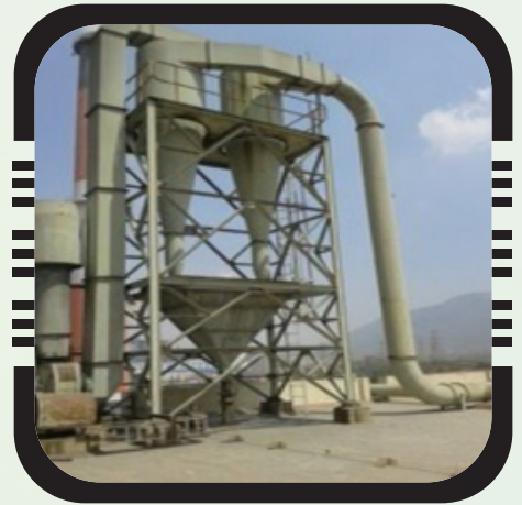
Pollution Control Systems