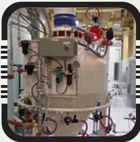
Dense Phase Pressure Conveying System