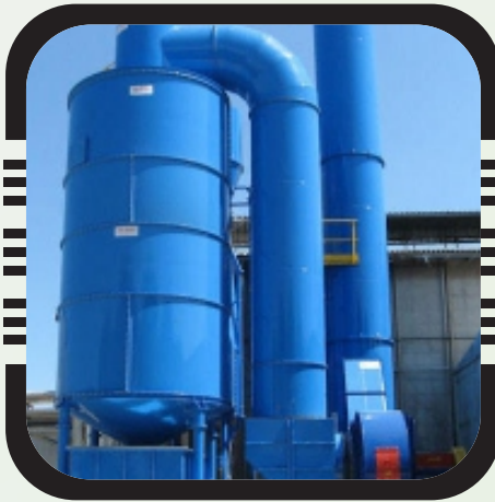
Pollution Control Scrubbers