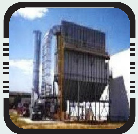
Air Pollution Prevention Cyclone