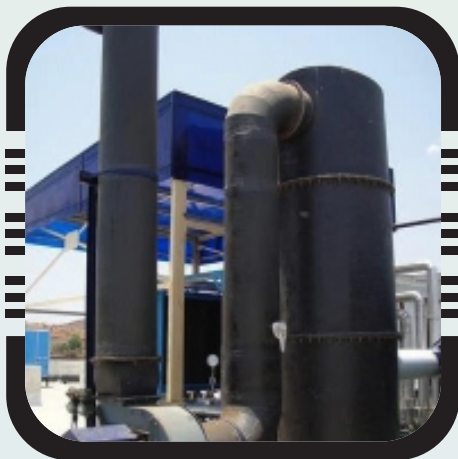
Air Pollution Scrubbers