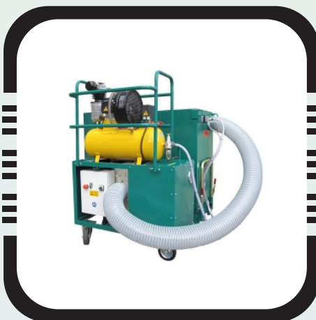
Portable Dust Collector