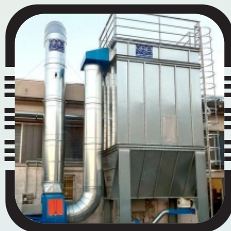
Industrial Dust Extraction System