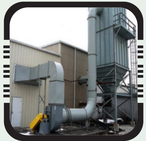
Bag Filtration System