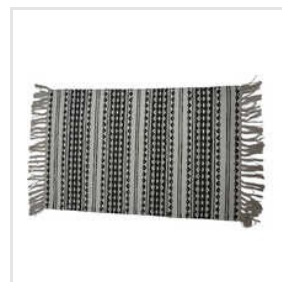
Rectangular Handwoven Durries