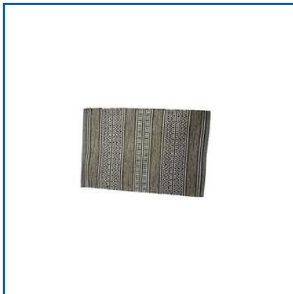
HANDWOVEN COTTON DURRIES

Designer Handloom Durries, Handwoven Cotton Durries, Handwoven Pure Cotton Durries, Rectangular Handwoven Durries, etc.