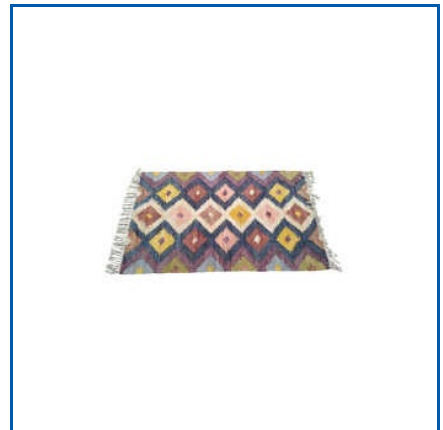
DESIGNER HANDLOOM DURRIES