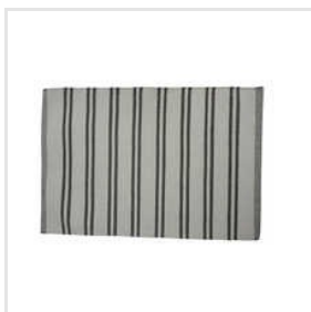
Handwoven Pure Cotton Durries