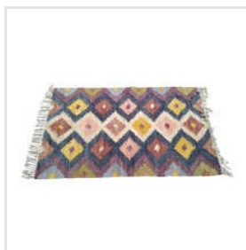
Designer Handloom Durries