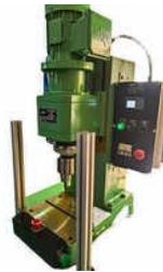
Riveting Machine With Process Monitoring