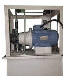
Hydraulic Riveting Machine