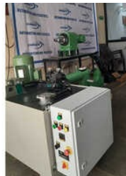
Portable Hydraulic Riveting Machine