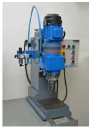
Automatic Contact Riveting Machine