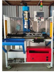
Tapping Spm Machine