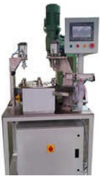
Index Based Riveting SPM