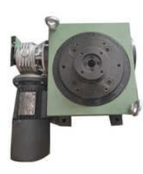
Metal Cam Indexing Table