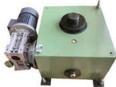
Rotary Indexing Table