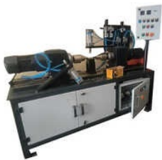
DUAL HEAD ORBITAL RIVETING MACHINE

Assembly SPM Machine, Auto Screwing Machine, Automatic Contact Riveting Machine, Bottom Riveting Machine, Dual Head Orbital Riveting Machine, Hydraulic Hand Held Riveting Machine, Hydraulic Riveting Machine, Index Based Riveting SPM, Industrial Indexing Drives, Industrial Nut Clinching Machine, Industrial Rotary Indexing Table, Industrial Tapping Machine, Metal Cam Indexer Drive, Metal Cam Indexing Table, Pneumatic Orbital Riveting Machine, etc.