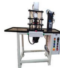
BOTTOM RIVETING MACHINE