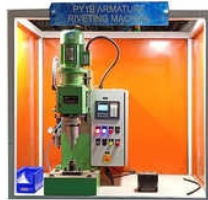
SPIN RIVETING MACHINE