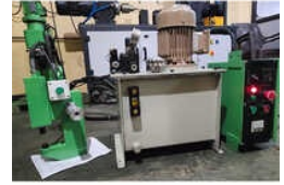
Hydraulic Hand Held Riveting Machine