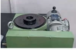
Industrial Indexing Drives