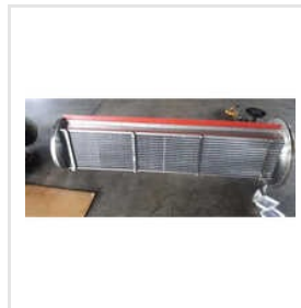
Tube Heat Exchanger