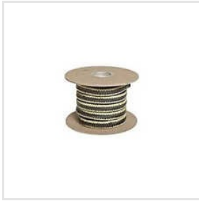
Graphited PTFE Rings