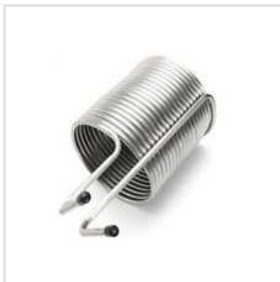
Coil Heat Exchanger