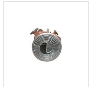
Spiral Heat Exchanger