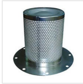
Air Oil Separator