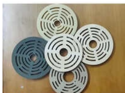
COMPRESSOR VALVE PLATES

Air Compressor Filters, Air Compressor Parts, Air Compressor Valve Blade, Air Compressor Valves, Air Cooled Heat Exchanger, Air Oil Coolers, CNG Compressor, Compressor Cooler, Compressor Valve Plates, Gas Compressor Parts, Gas Compressor Valves, Gland Packing Seal, Heat Exchangers Process Plant, Heatless Compressed Air Dryers, Industrial Filters Separators, etc.