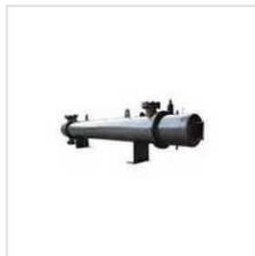
Industrial Oil Coolers