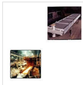
Heat Exchanger For Process Plants