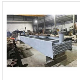
Industrial Air Cooled Heat Exchanger