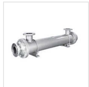
Tube And Shell Heat Exchanger