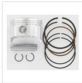
Air Compressor Kits