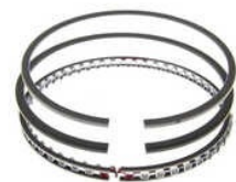
PISTON RING SETS