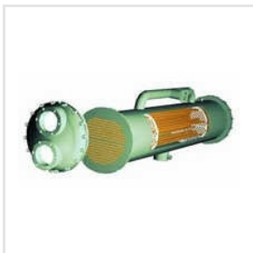
Shell And Tube Condenser For Ice