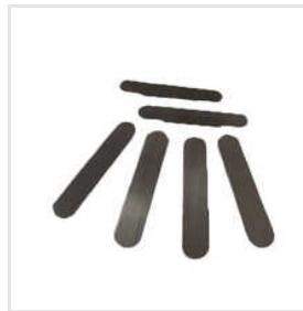
Air Compressor Valve Blade