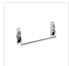
Single Point Panic Nar