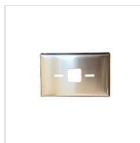
SS Exit Switch Plate