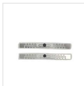
UHF Windscreen Tags