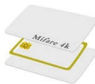
MIFARE 4K CARD