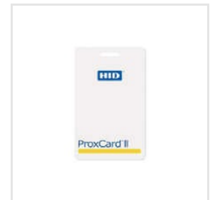
HID Proximity Card