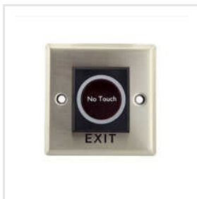
No Touch Exit Switch