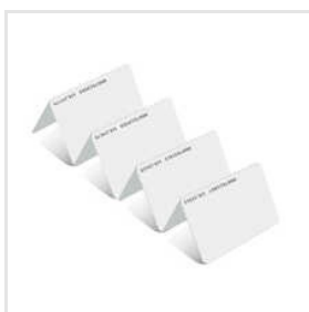
0.8mm ISO Proximity Cards Thin