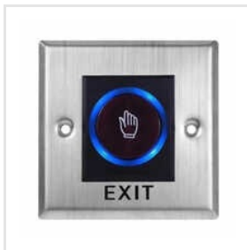
Door Infrared No Touch EXIT Button Switch