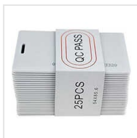
Thick Card Proximity Card