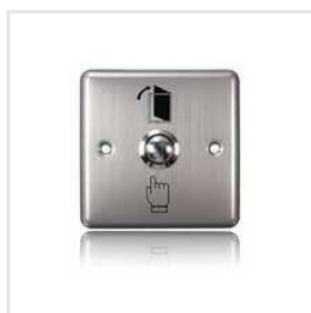
SS Exit Switch