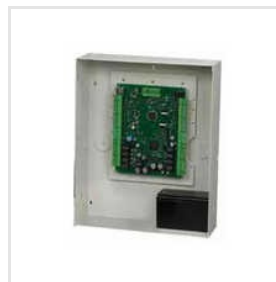
Universal Cabinet For Singal PCB