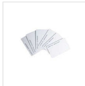
ISO Proximity Cards