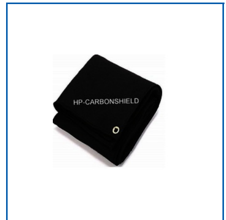
HP/CARBONSHIELD CARBON FIBER FIRE WELDING BLANKET