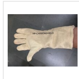
Non-Asbestos Hand Gloves