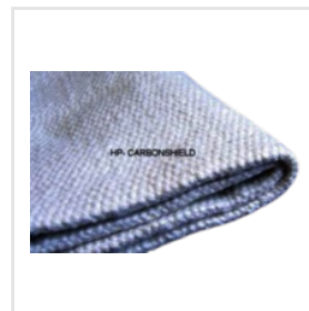
Ceramic Welding Blanket With SS Wire