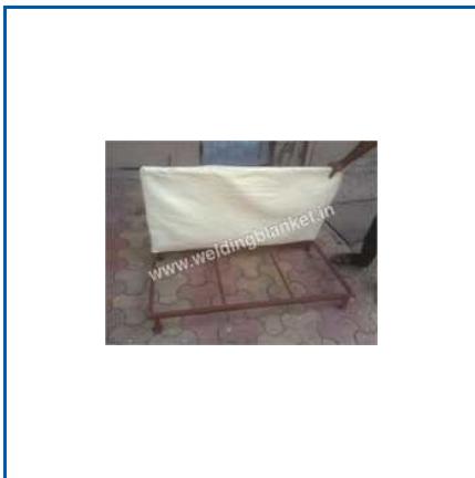
WELDING RESISTANT PILLOW WITH STAND

Aramid Fiber Hand Gloves, Body Cooling and Warming Bag, Ceramic Fiber Cloth For Safety Blankets, Ceramic Fire Welding Blanket, Ceramic Welding Blanket With SS Wire, Coating Cloth, Cooling jacket, Fiberglass Welding Blankets, Fire Resistant Waterproof PVC Tarpaulin, Fire Resistant Waterproof Tarpaulin, Fire Safety Suit, Galvanized Scaffold Planks, Galvanized Steel Scaffold Planks, Graphite Coated Fiberglass Fire Blanket, Graphite Coated Fiberglass Welding Blanket, etc.