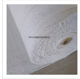
Ceramic Fiber Cloth For Safety Blankets