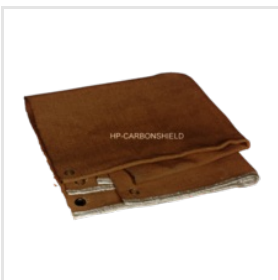
Ceramic Fire Welding Blanket