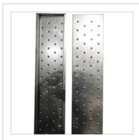
Galvanized Steel Scaffold Planks