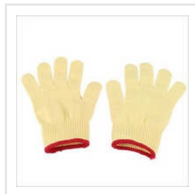
Aramid Fiber Hand Gloves