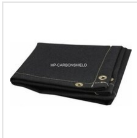
Graphite Coated Fiberglass Fire Blanket