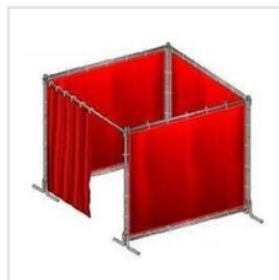
Pvc Welding Curtains