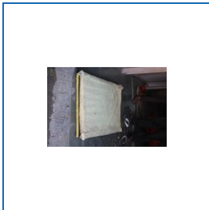
WELDING HEAT RESISTANT PAD