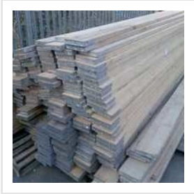
Galvanized Scaffold Planks