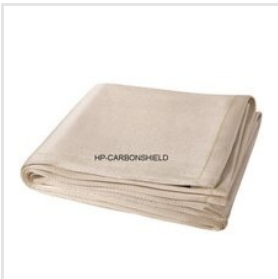
Silica Fire Welding Blanket