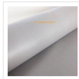
PVC Coated Fiberglass Cloth With Fire