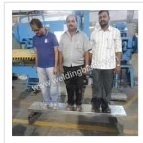
Steel Scaffolding Walk Board