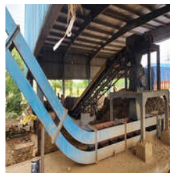
Material Handling System