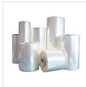
Biaxially Oriented Polypropylene