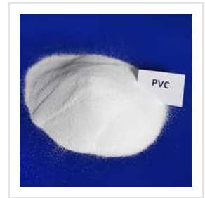
Poly Vinyl Chloride