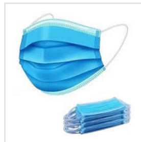
Blue Face Mask