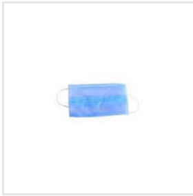
Sterile Disposable Face Mask