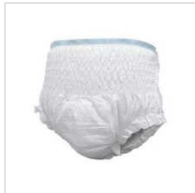
Size -M Pull-Up Adult Diaper