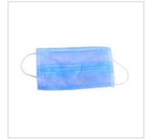
Sterile 3 Ply Face Mask