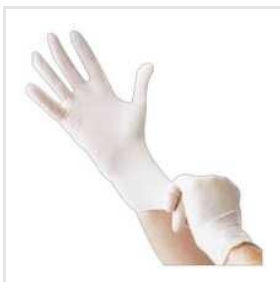
9 Inch Latex Examination Gloves