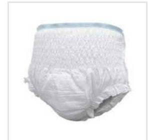
Pull-Up Adult Diaper