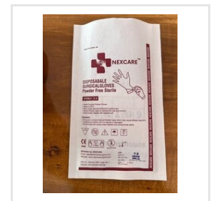
Powder Free Sterile Gloves