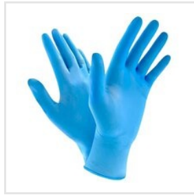
Nitrile Examination Gloves