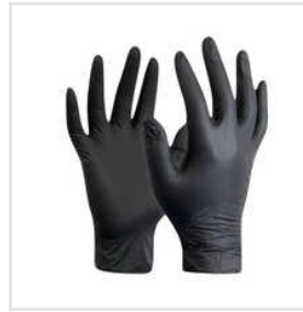
Black Disposable Nitrile Gloves