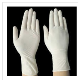
Non Sterile Examination Gloves