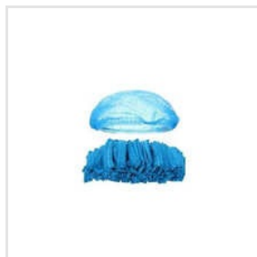
Surgical Disposable Cap