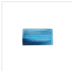
3 Ply Face Mask