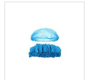
Surgical Disposable Cap