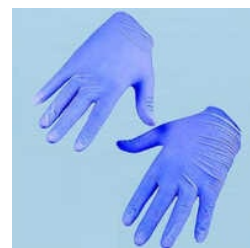
POWDER FREE EXAMINATION GLOVES