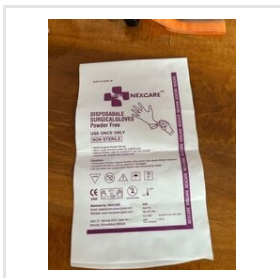
Powder Free Non Sterile Surgical Gloves