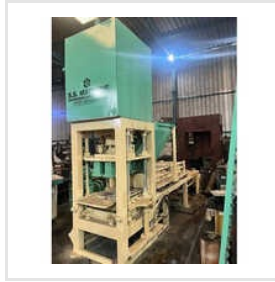
12 Cavity Automatic Fly Ash Brick Making