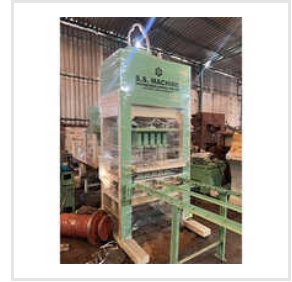
10 Bricks Fully Automatic Fly Ash