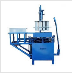
Manual Fly Ash Brick Making Machine