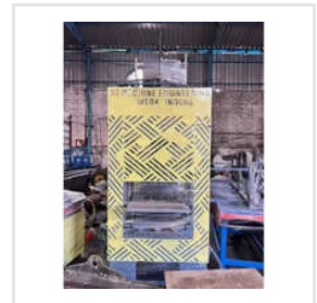
New 8 Cavity Automatic Fly Ash