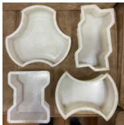
SILICON PLASTIC MOULD

10 Bricks + Solid Block Double Cylinder Fly Ash Brick Making Machine, 10 Bricks Fully Automatic Fly Ash Bricks Making Machine, 10 Cavity Automatic Fly Ash Brick Making Machine, 10 x 2.5 mm Heavy Duty Vibrating Table, 12 Cavity Automatic Fly Ash Brick Making Machine, 15 Cavity Automatic Fly Ash Brick Machine, 2 In 1 Hydraulic Semi Automatic Bricks And Paver Making Machine, 2+2 Hydraulic Semi Automatic Bricks And Paver Making Machine, etc.