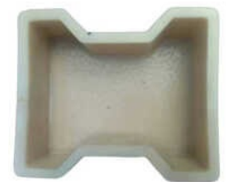
PVC PAVING BLOCK MOULDS