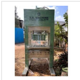
Automatic Paving Block Fly Ash Bricks