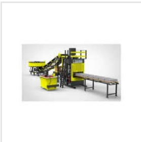
Automatic Fly Ash Brick Making Machine