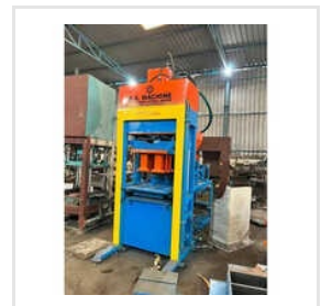
4 Cavity Automatic Fly Ash Bricks Making