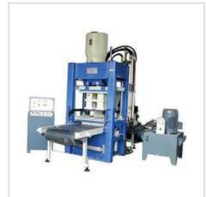
MS Automatic Fly Ash Brick Making Machine