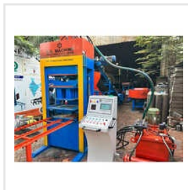
MS Fly Ash Brick Making Machine