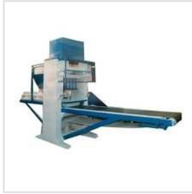
15 Cavity Automatic Fly Ash Brick Machine