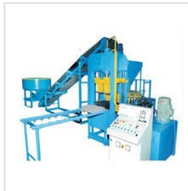
Fly Ash Bricks And Block Making Machine