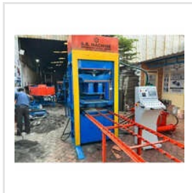
8 Cavity Automatic Fly Ash Bricks Making