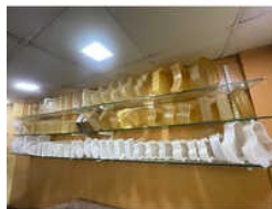
PAVER BLOCK MOULD IN INDORE