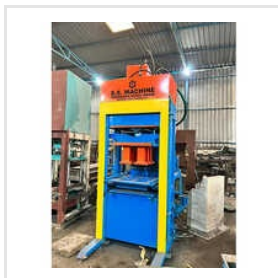
6 Bricks Fully Automatic Fly Ash