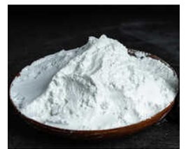
90% Potash Feldspar Powder