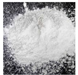
80% White Calcite Powder