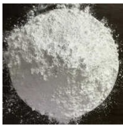
90% White Calcite Powder