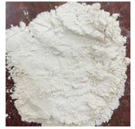
95% Mineral Powder Feldspar