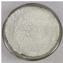
97% Soda Feldspar Powder