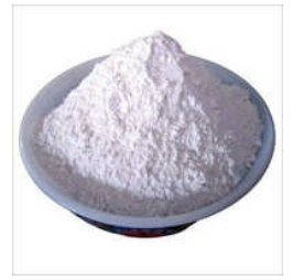
White Dolomite Powder