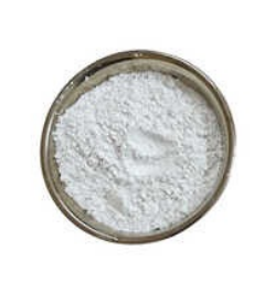
93% Dolomite Powder