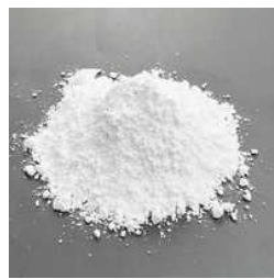
98% White Calcite Powder