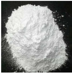
92% Sodium Feldspar Powder