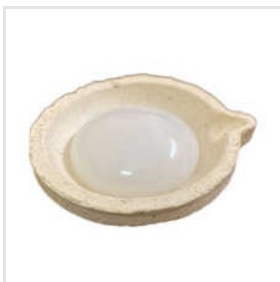
White Feldspar Powder