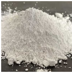
Potash Feldspar Powder