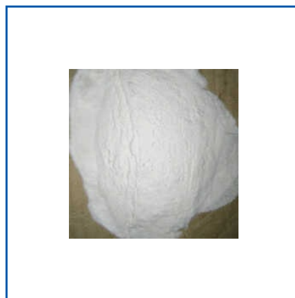
90% QUARTZ RAMMING MASS POWDER