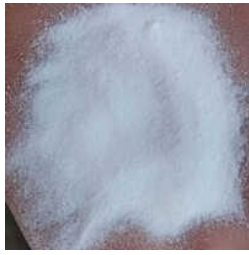
93% Quartz Acidic Ramming Mass