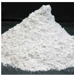
95% White Calcite Powder