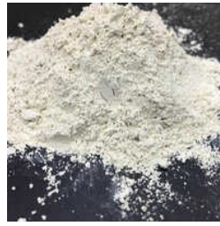
Ramming Mass Powder