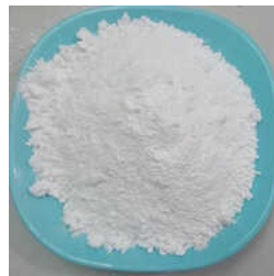
99% Potassium Feldspar Powder