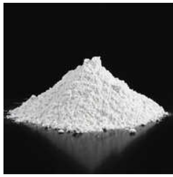
96% Dolomite Powder