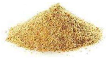
Soya Bean Meal