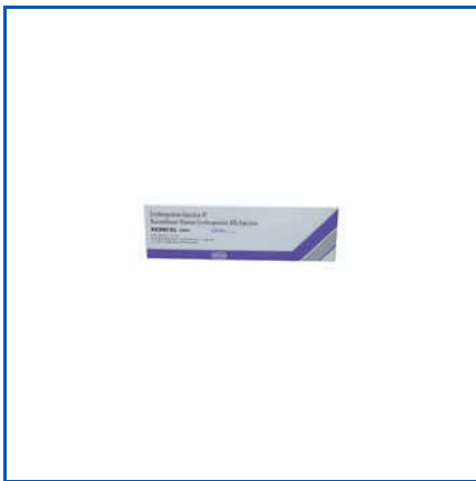
ERYTHROPOIETIN RENOCEL 10000 IU

0.5ml Boostrix Effective Vaccine Option Trusted Vaccine, 0.5ml Diphtheria Tetanus Pertussis Hepatitis B Haemophilus Influenzae Conjugate Vaccine, 0.5ml Prevenar Pneumococcal Polysaccharide Conjugate Vaccine, 0.5ml Tresivac PFS Measles Mumps Rubella Vaccine, 0.5ml Typbar-PFS Typhoid Polysaccharide IP Vaccine, 10mg Lenalid Lenalidomide Capsules, etc.