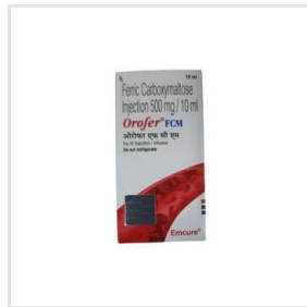
Orofer Fcm 500 Ferric Carboxymaltose