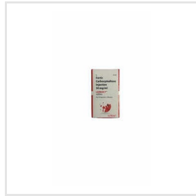
Larinject 50 Mg Ferric Carboxymaltose