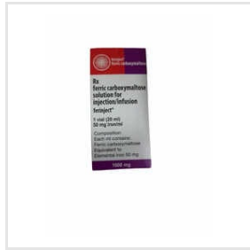
Ferinject 50mg Rx Ferric Carboxymaltose