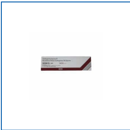
ERYTHROPOIETIN RENOCEL 4000 INJECTION