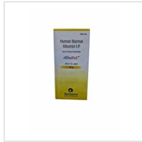
Human Normal Albumin Alburel 20%