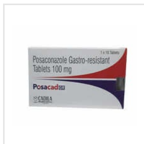
Posaconazole Gastro-resistant Tablet 100mg