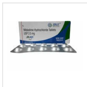
Jolavi 2.5 Mg Midodrine