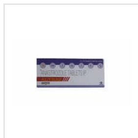
Altraz Anastrozole Tablet