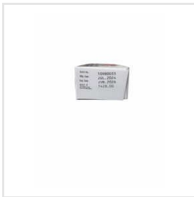
Anfoe 4000 Iu Erythropoietin Injection