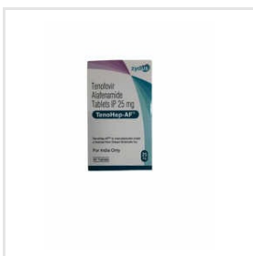
Tenohep Af Tenofovir Alafenamide Tablet