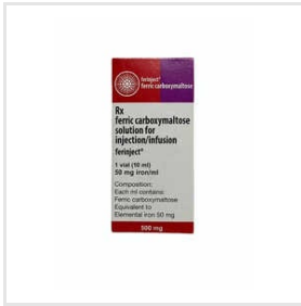
Ferinject Rx Ferric Carboxymaltose