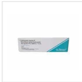
Anfoe 10000 Iu Erythropoietin Injection