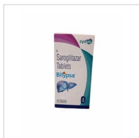
Bilypsa 4mg Soroglitazar Tablets