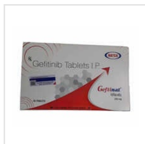
Gefitinat 250mg Gefitinib Tablet