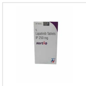
Hertab 250mg Lapatinib IP Tablets