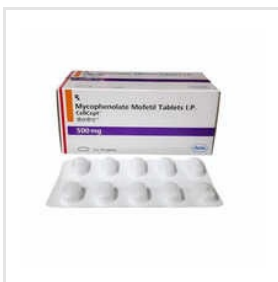
Mycophenolate Mofetil Tablets 500mg