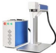
DESKTOP LASER MARKING MACHINE