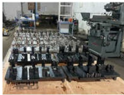
Profile Checking Gauges