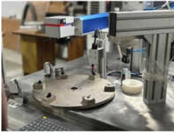
Indexing Fixtures With QR Code Marking SPM