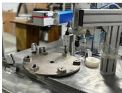
LASER MARKING ROTARY INDEXER WITH TRACEABILITY

Automated Assembly Line, Automatic Leak Testing Machine, Desktop Laser Marking Machine, EOL Industrial Machinery, Indexing Fixtures with QR Code Marking SPM, Industrial Assembly Fixtures, Laser Marking Rotary Indexer With Traceability, Material Handling Trolley, Mild Steel Fixtures, Performance Testing Machine, Profile Checking Gauges, etc.