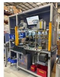
AUTOMATIC LEAK TESTING MACHINE