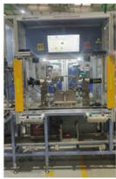
EOL Industrial Machinery