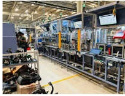
Automated Assembly Line