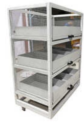
Material Handling Trolley