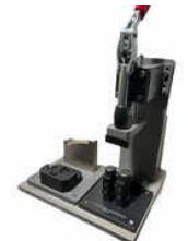
Industrial Assembly Fixtures