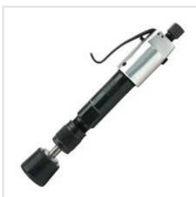
Pneumatic Bench Rammer