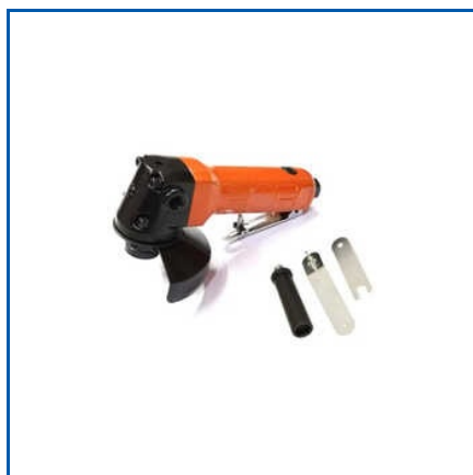
PNEUMATIC ANGLE GRINDER

BBD 12 D Rock Drill Machine, Ball Bearing Unit, Ball Bearings, Bbc 120f Drifter machine, Boomer Shank Adapter, Button Bit, Chisel Moil Point, Coupling Sleeve, DTH Button Bit, Drifter Drill Rod, Drilling Tube, Duplex Roller Chain, Extension Rod, Piglite Machine, Pneumatic Angle Grinder, etc.