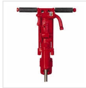
Rock Drill Machine