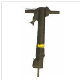
Pneumatic Jack Hammer