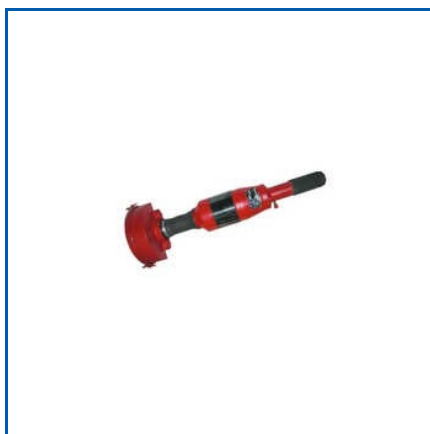
PNEUMATIC STRAIGHT GRINDER