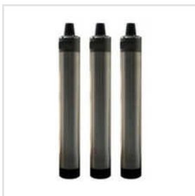
Pneumatic DTH Hammer