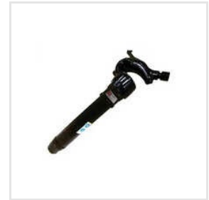
Pneumatic Riveting Hammer