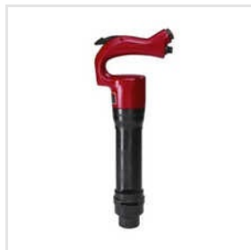
Pneumatic Chipping Hammer