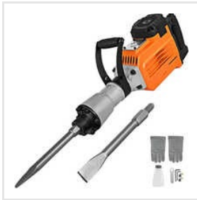
Pneumatic Electric Jack Hammer