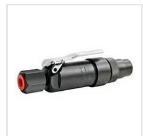
Pneumatic Pencil Die Grinder