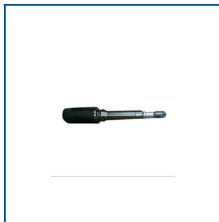
PNEUMATIC DIE GRINDER