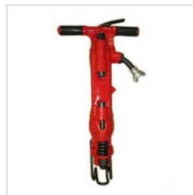
Pneumatic Paving Breaker