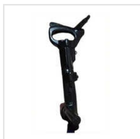
BBD 12 D Rock Drill Machine