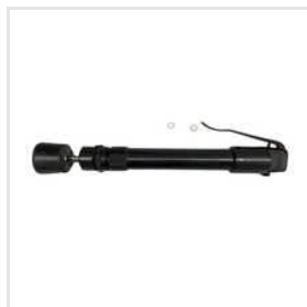
Pneumatic Sand Rammer