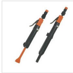
Pneumatic Weld Flux Chipper