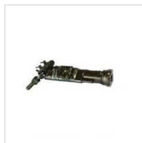
Bbc 120f Drifter Machine