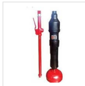
Pneumatic Sand Rammer