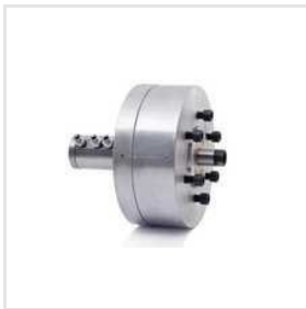
Pneumatic Rotating Cylinder