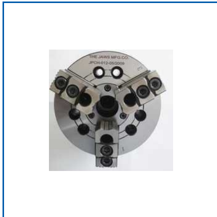
HIGH SPEED POWER CHUCKS