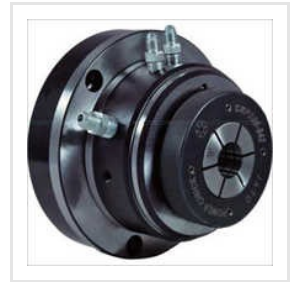
CHP 200 Cylinder Integrated Hydraulic