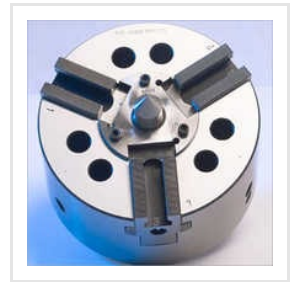
Jaws Eccentric Compensating Chuck