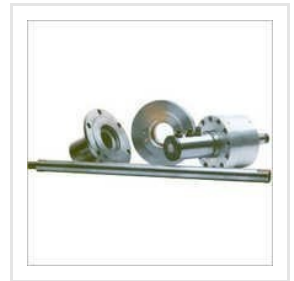
Hydraulic Rotary Cylinder