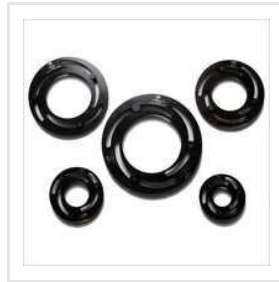
Jaws Boring Rings