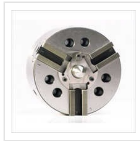
Jaws Eccentric Compensating Chuck