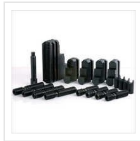
Jaw Spares Parts