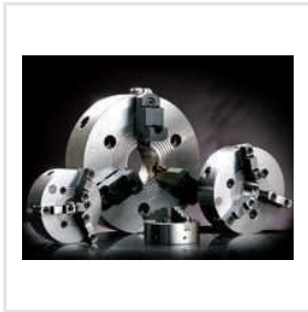
Quick Jaw Change Power Chucks