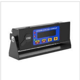
On Board Load Measuring System