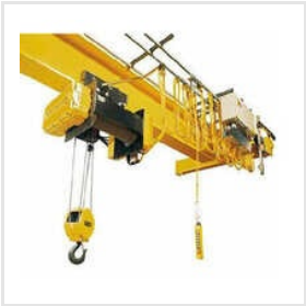
Crane Overload Protection System