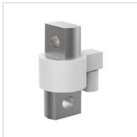
STK Tension Load Cell