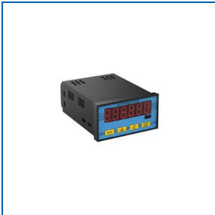
SI-01 DIGITAL INDICATOR

Auto Spring Tester, Bulk Weighing Systems, Check Weigher, Clutch Pedal Force System, Compression Load Cell, Compression Load Sensor, Container Weighing, Crane Over Load Protection System, Crane Weighing Systems, Digital Indicator , Digital Load Indicator , Digital Weighing Indicator, Double Ended Shear Beam Load cell , Electronic Digital Indicators, Heavy Duty S Type Load Sensor, etc.