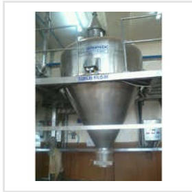
Tank Weighing System With Panel