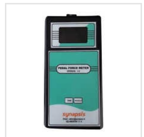
Manual Pedal Force Meter