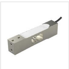
LDP Singal Point Load Cell