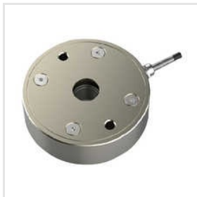
LWT Web Tension Load