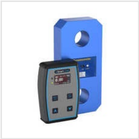
Digital Wireless Dynamometer