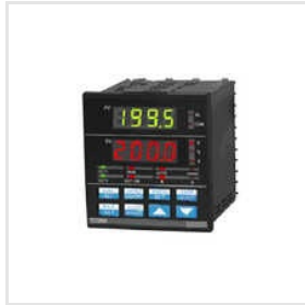
TC-950 Web Tension Controller