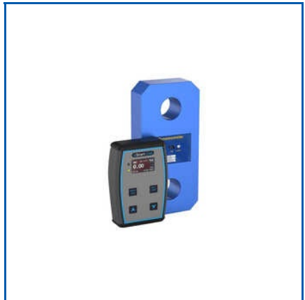
DIGITAL WIRELESS DYNAMOMETER