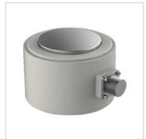
Compression Load Cell