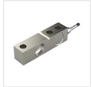
SBC Singal Point Load Cell