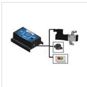
Industrial Tilt Switch System