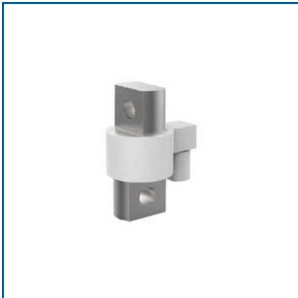
STK TENSION LOAD CELL