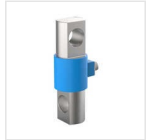
SP-1000 Tension Load Cell