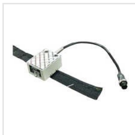
Manual Pedal Force Meter Sensor