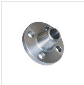
SS Weld Neck Flange