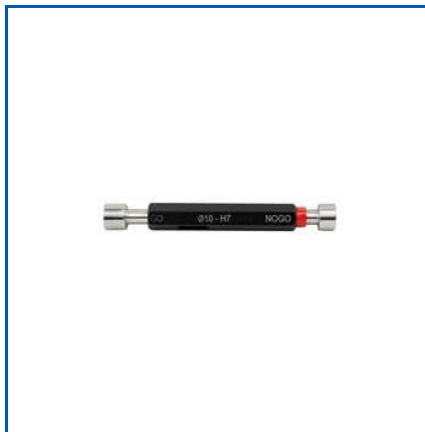
GO NO GO PLUG GAUGE