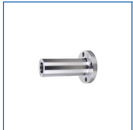
STAINLESS STEEL LONG WELD NECK FLANGE