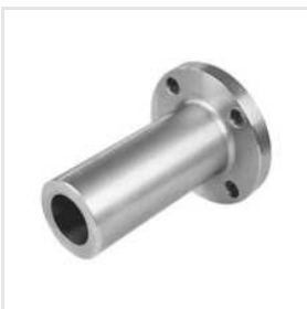
Industrial Long Weld Neck Flange