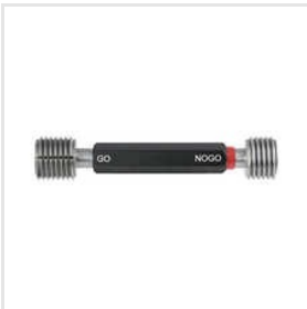
Baker Plug Gauges