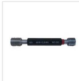
Metric Thread Plug Gauges