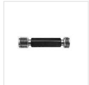
Industrial Thread Plug Gauge