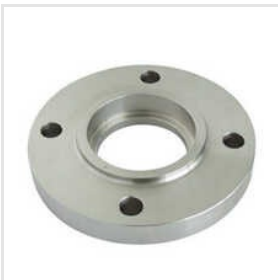
SS Socket Weld Flange