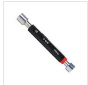
Double Ended Thread Plug Gauge