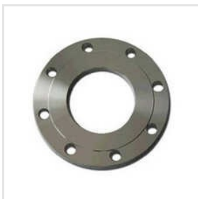
SS Slip On Flange