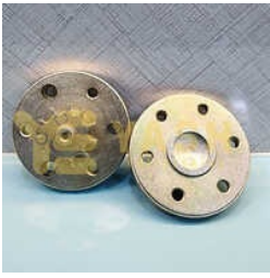
CNC Turned Components Services