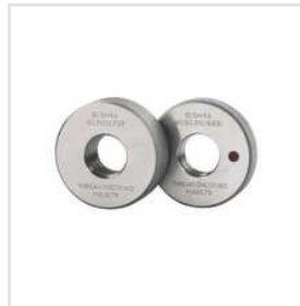
SS Thread Ring Gauge