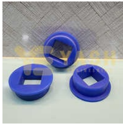
Precision Components Services