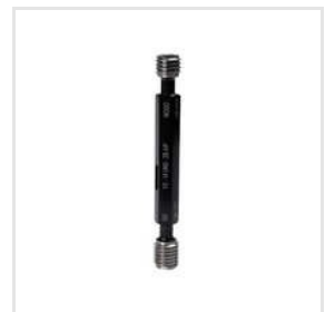
Metric Taper Gauge