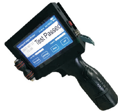
HAND COADING MACHINE