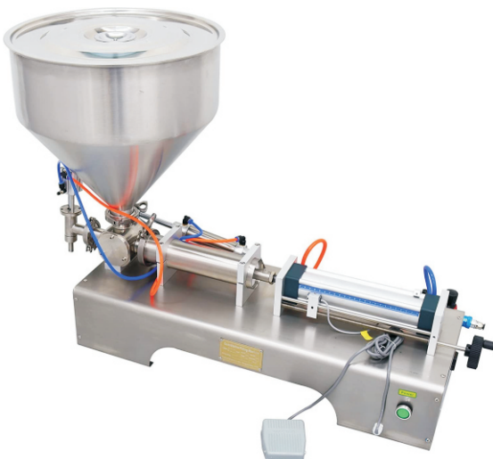
SEMI AUTOMATIC PEST SEALING MACHINE