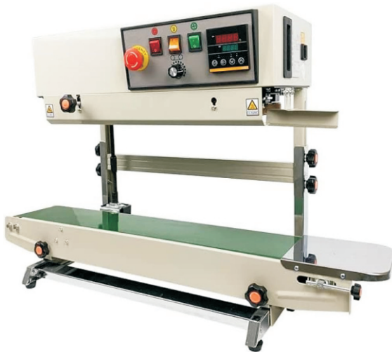
CONTNUS BAND SILING MECHINE