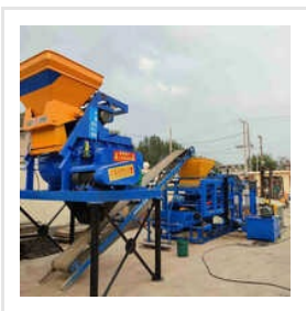
Qt418 Automatic Cement Hollow Block