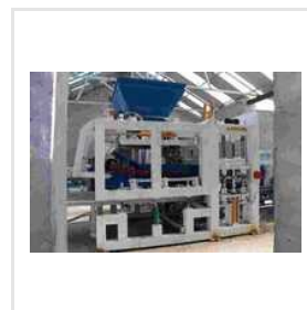
QT1015 Automatic Building Material