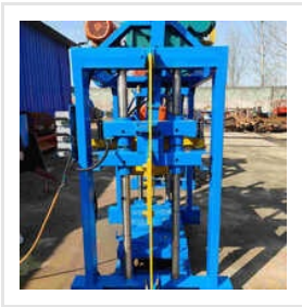
Qt440 Automatic Manual Small Concrete