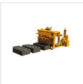
Qt403A Small Movable Cement Solid Brick