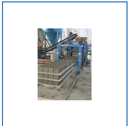
QT615 CONCRETE HOLLOW BLOCK PRODUCTION LINE