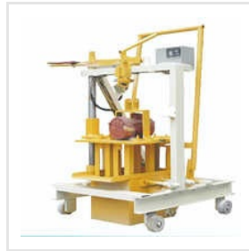
QT403C Mini Small Moving Mobile