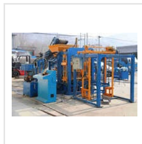
QT418 Automatic Concrete Cement