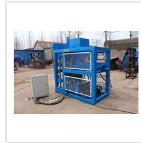
QT110 Automatic Rotary Logo Clay Brick