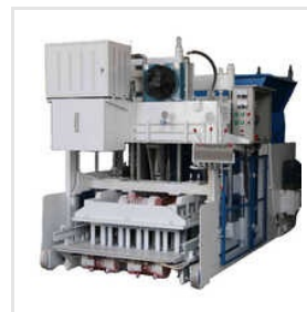
QT1025 Mobile Egg Laying Brick Machinery