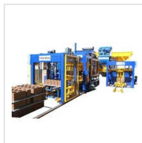
QT415 Hydraulic Automatic Block