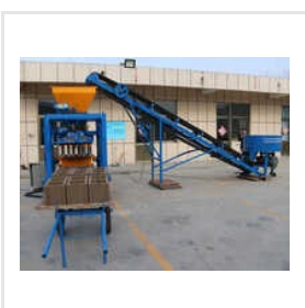
Qt424 Concrete Fly Ash Block Making Machine