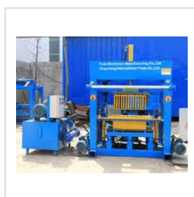
QT430 Diesel Hollow Block Making Machine