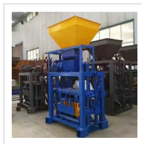
QT435 Cement Concrete Interlocking