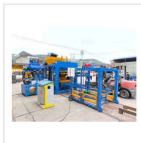
Qt1015 Fully Automatic Block Brick Making