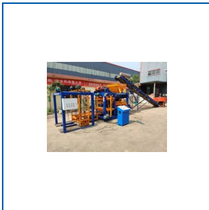
QT425 INTERLOCKING FLY ASH BRICK MAKING MACHINERY