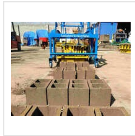
QT445 Diesel Egg Laying Concrete Block