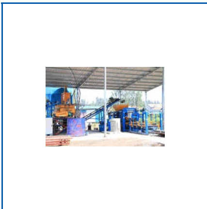
QT815 FULL AUTOMATIC CONCRETE BLOCK MAKING MACHINERY

11.75kw Pipe Making Machine, 3kw Stacking Machine, 400kw Diesel Generator, Automatic Block Stacking Machine, Automatic Brick Stacking and Wrapping Machine, Automatic Compress Earth Block Maker Machinery, Color Feeder Machine, Electric Excavator, Electric Loader, Electric Scaffolding Lifting Machine, FD120 Hydraulic Clay Interlocking Brick Making Machine, FD220 Hydraulic Clay Interlocking Brick Making Machine, FD225 Hydraulic Clay Interlocking Brick Making Machine, FDC1 Electric Forklift, Fuda Road Paving Machine, etc.