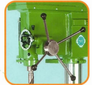
Hand Fine Feed

* Specification for model no SI - A/2 & SI - 3