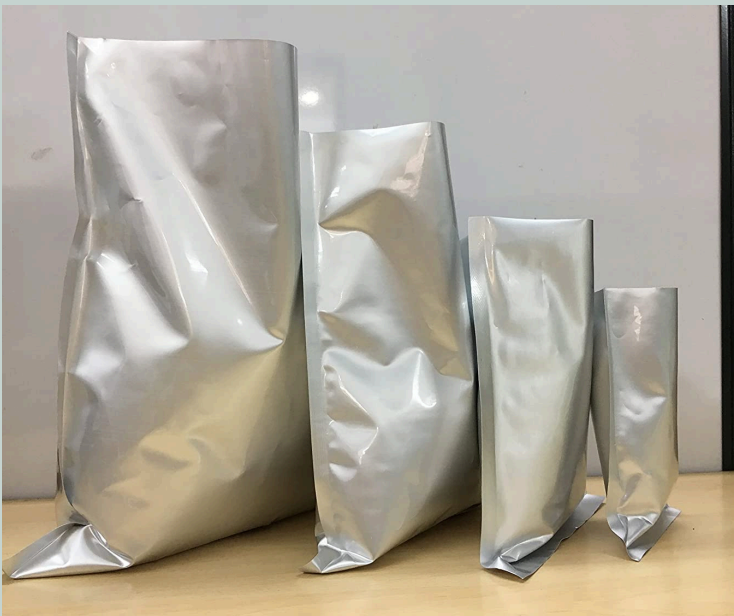
3 SIDE SEAL POUCH