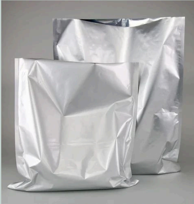
25 & 50 KG LINER