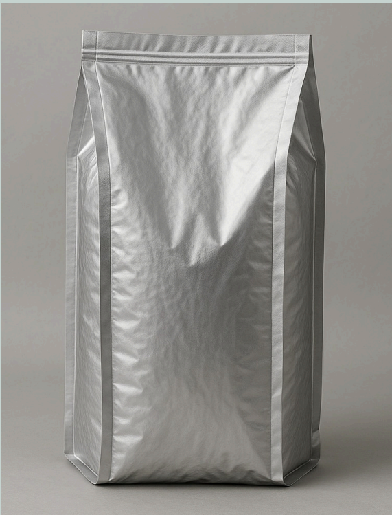
SIX SIDE SEAL GUSSET BAG