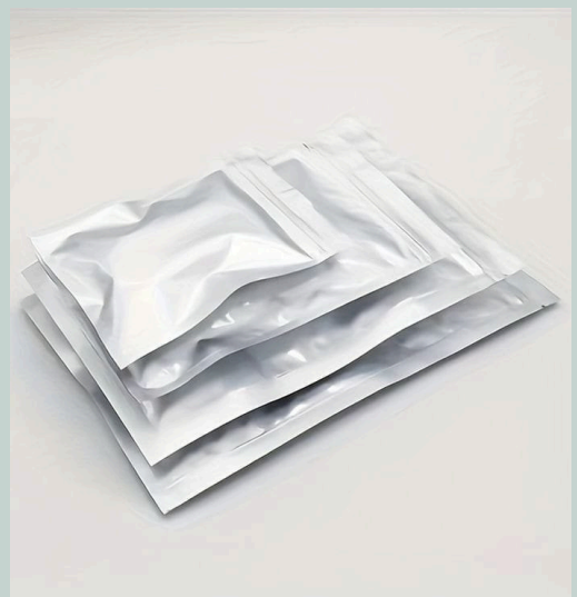
3 SIDE WITH ZIPPER