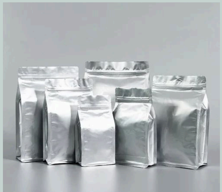
GUSSET BAG AND POUCH