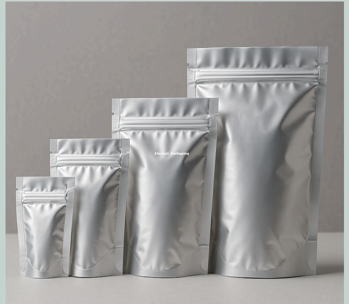
STAND-UP WITH ZIPPER