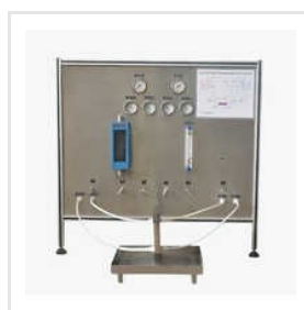
Lab Scale MBR