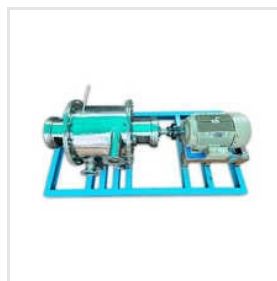
Dynamic Hydrodynamic Device