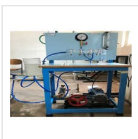
Cross Flow Ultrafiltration System