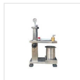
HF Membrane Spinning Unit