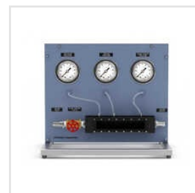
Static Hydrodynamic Cavitation Device