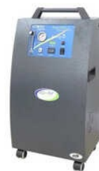
INDUSTRIAL GRADE OXYGEN CONCENTRATOR