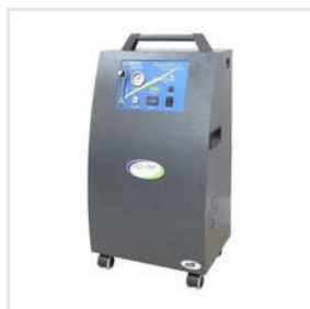
Industrial Grade Oxygen Concentrator