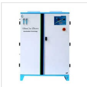
NBT For Aquaculture