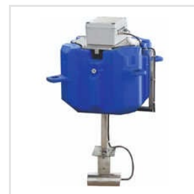
Ultrasonic Algae Control Device For