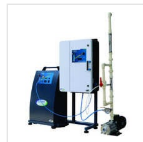
Ozone Generator For STP, ETP, WTP