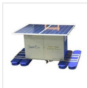
Solar Based Algae Control Device For