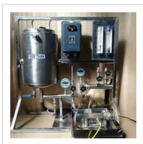
RO, UF, FO Membrane Test Skid