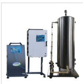
Ozone Generators For Swimming Pool