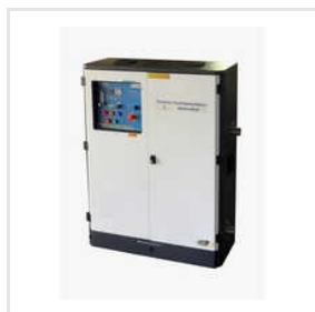
NBT For Agriculture And Horticulture