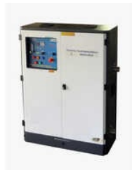
NBT FOR AGRICULTURE AND HORTICULTURE