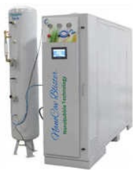
NBT FOR LAKE AND POND TREATMENT

Cross Flow Ultrafiltration System, Dynamic Hydrodynamic Device (Stator-Rotor Based), HF Membrane Spinning Unit, Industrial Grade Oxygen Concentrator, Industrial and Commercial RO System, Lab Scale MBR, NBT for Agriculture and Horticulture, NBT for Aquaculture, NBT for Lake and Pond Treatment, NBT for STP, ETP, WTP, Ozone Generator for Drinking Water, Ozone Generator for STP, ETP, etc.