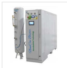
NBT For Lake And Pond Treatment