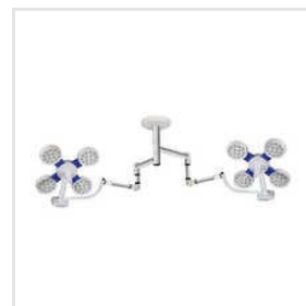
MS C-4+4 LED Surgical Lights