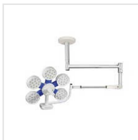
MS 3+4 LED Surgical Lights