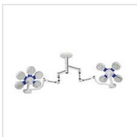
MS C-5+4 LED Surgical Lights