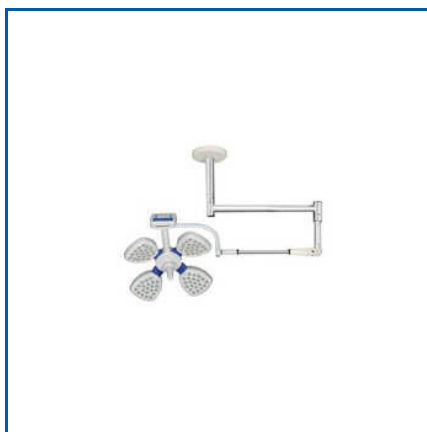
MS-BETA 4 LED SURGICAL LIGHTS