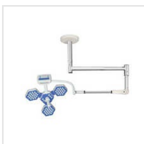
MS-HEX 105 LED Surgical Lights