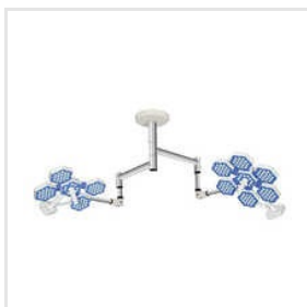
MS-HEX 126+84 LED Surgical Lights