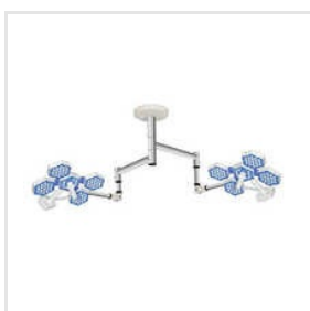
MS-HEX 84+84 LED Surgical Lights