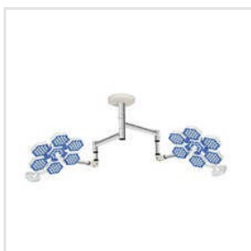
MS-HEX 126+126 LED Surgical Lights