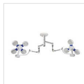
MS C-4+3 LED Surgical Lights