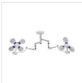
MS-C 4+3 LED Surgical Lights