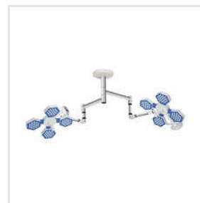
MS-HEX CT 4+4 LED Surgical Lights