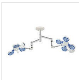
MS-HEX CT 4+3 LED Surgical Lights