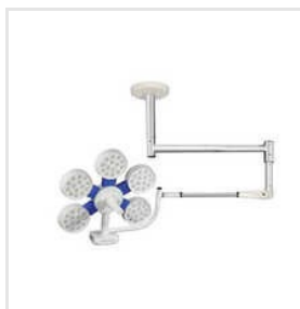
MS C-5 LED Surgical Lights