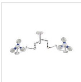
MS 3+3 LED Surgical Lights