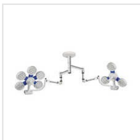
MS C-5+3 LED Surgical Lights