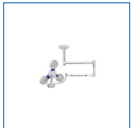
MS C-3 LED SURGICAL LIGHTS