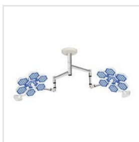
MS-BETA 126+126 LED Surgical Lights