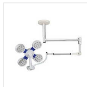
MS C-4 LED Surgical Lights