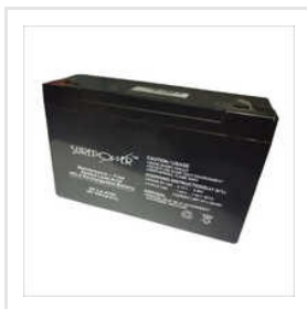
6V 10AH Sealed Lead Acid Battery