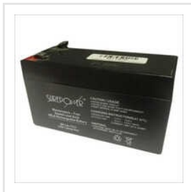
12V 1.2AH Sealed Lead Acid Battery