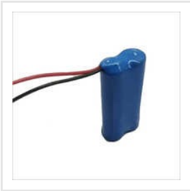
Surepower 2.4V 700mAh Ni Mh Battery