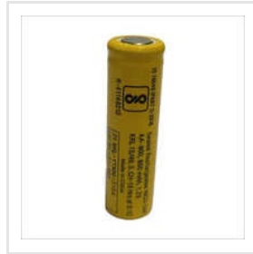
1.2V 800mAh NiCD Battery