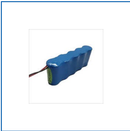
SUREPOWER 6V 3000MAH NI MH BATTERY PACK

Cham 3.7V, 2200mAH Li-ion Battery, 18650-2200mAH, Cham 3.7V, 2600mAH Li-ion Battery, 18650-2600mAH, Cham 3.7V, 3000mAH Li-ion Battery, 18650-3000mAH, Customized Battery Cell Pack, Cyclon Lead Tin, Li-ion, Lithium Battery, Ni MH Battery -500 MAH, Ni Mh, etc.