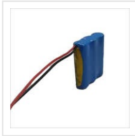
Sure Power 3.6V 700mAh Ni Mh Battery