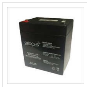
12V 4AH Sealed Lead Acid Battery