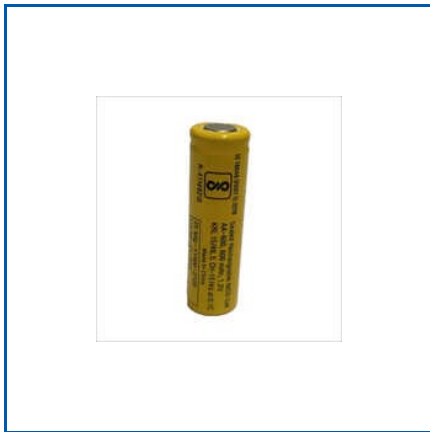
600MAH NICD BATTERY