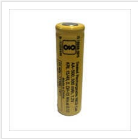
1.2V 500mAh NiCD Battery