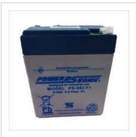
6V 9AH Sealed Lead Acid Battery