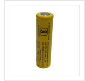
1.2V 700mAh NiCD Battery