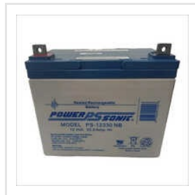
12V 33AH Sealed Lead Acid Battery