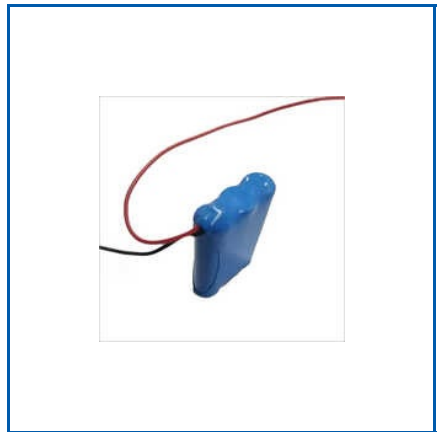
SURE POWER 3.6V 800MAH NI MH BATTERY PACK