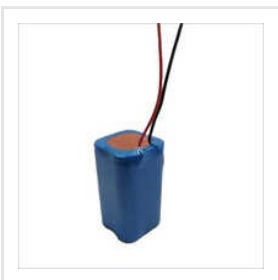
Cham 7.4V 5200mAh Li Ion Battery Pack