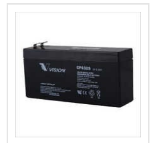
8V 3.2AH Sealed Lead Acid Battery