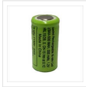
1.2V 500mAh Ni Mh Battery