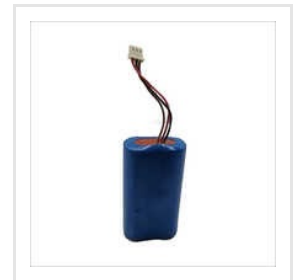
Cham 3.7V 5200mAh Li Ion Battery Pack