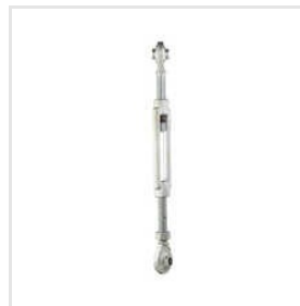
Turn Buckle Style Top Link