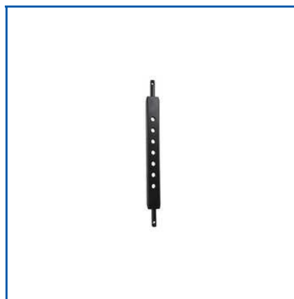
TRACTOR DRAW BAR