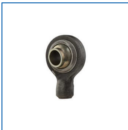
TOP LINK SOCKET AND BALL