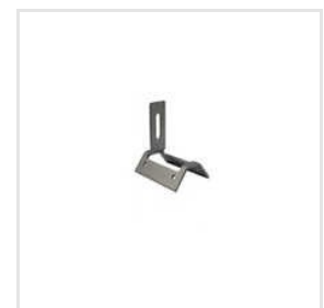
Sheet Metal Clamps