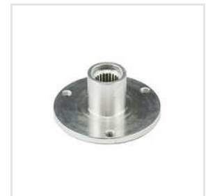
Go Kart Wheel Hub Link