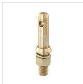
Lower Linkage Pin