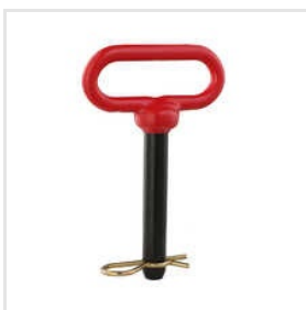
Red Hitch Pin