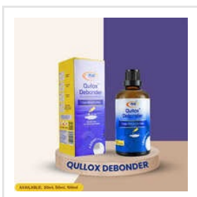
QULLOX Debonder - 100ml