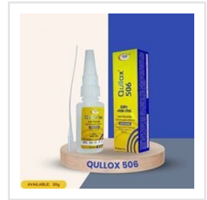
QULLOX 506 - Instant Adhesive - 20gm