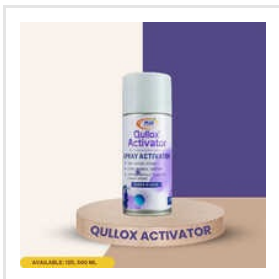
QULLOX Activator Spray - 125ml