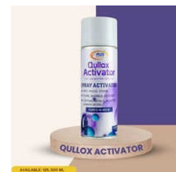
QULLOX ACTIVATOR SPRAY-500ML