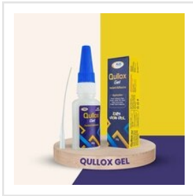
QULLOX HV GEL - 20gm