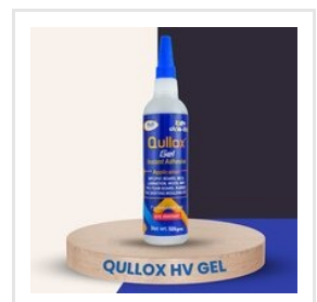
QULLOX HV GEL - 125gm