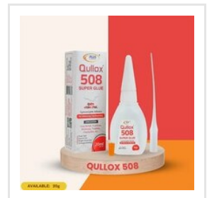
QULLOX 508 - Instant Adhesive - 20gm