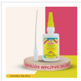
QULLOX WPC-PVC Glue - 50gm