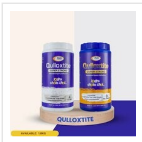
QULLOXTite - Super Strong Epoxy Adhesive