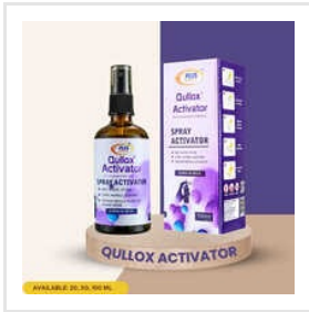
QULLOX Activator Spray - 100ml