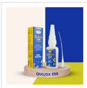
QULLOX 256 - Instant Adhesive - 20gm