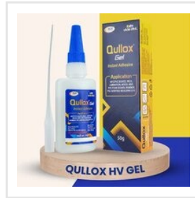
QULLOX HV Gel - 50gm