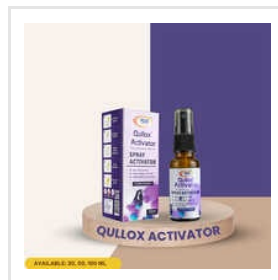
QULLOX Activator Spray - 20ml