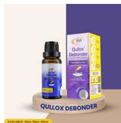
QULLOX DEBONDER -20ML