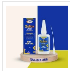
QULLOX 256 - Instant Adhesive - 50gm