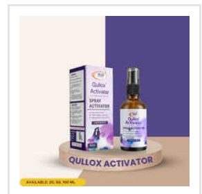
QULLOX Activator Spray - 50ml