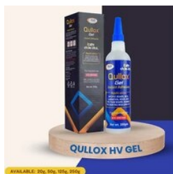
QULLOX HV GEL - 250GM

Fass Qwick Pouch Pack -500mg, Foogofix Pouch Pack -500mg, Gixu Ptfе Thread Seal Tape -10mtrs, Gixu Ptfе Thread Seal Tape -12mtrs, Gixu Ptfе Thread Seal Tape -15mtrs, Gixufix Flat Loop Flex -12gm, Gixufix Flat Loop Flex -18gm, Gixufix Pouch Pack -500mg, Gixufix RD Flex -10gm, Gixufix RD Flex -15gm, Gixufix RD Flex -20gm, Pixu GP -12gm, Pixu GP -15gm, Pixu GP -18gm, Pixu GP -20gm, etc.