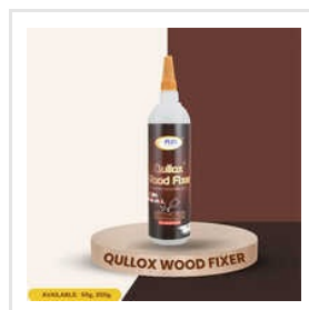
QULLOX Woodfixer - 250gm