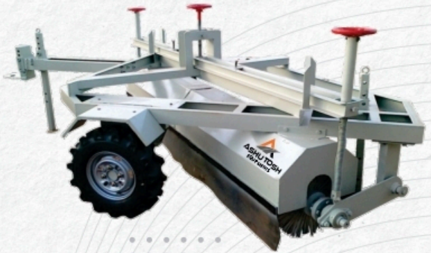
Model - ABM2400