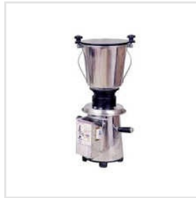
5 L Heavy Duty Mixer