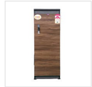
1HP Basic Flour Mill