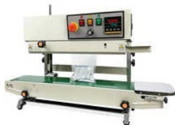
HORIZONTAL BAND SEALER

1 5HP Mini Stone Mill, 1 5HP Shevya Machine, 10 KG Square Type Flour Mixer, 10 L Domestic Water Purifier, 10 L Heavy Duty Mixer, 12 L Water Purifier, 14 Inch Stone Mill, 1HP 2 In 1 Flour Mill, 1HP 2 In 1 Primum Flour Mill, 1HP Basic Flour Mill, 1HP Regular Flour Mill, 2 Rod Semi Mirchi Kandap, 2000 Watt Oil Extraction Machine, 2HP 2 In 1 Domestic Flour Mill, 2HP Chatani Masala Machine, etc.