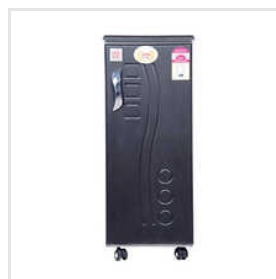
1HP 2 In 1 Primum Flour Mill