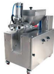
DOUGH BALL MAKING MACHINE