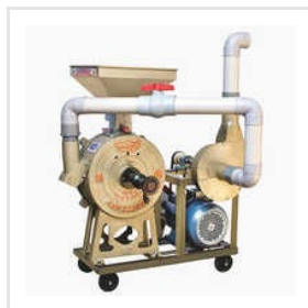
3HP Dal Mill