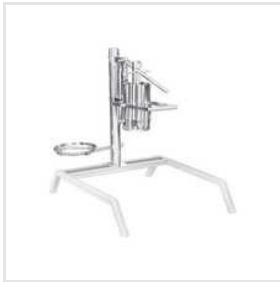
Manchurian Making Machine