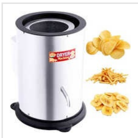
Food Dryer Machine