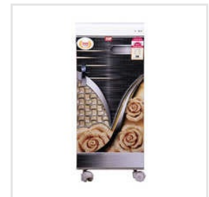
2HP Domestic Flour Mill