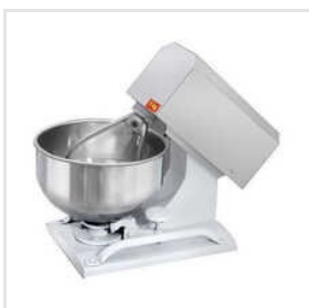
5 KG Flour Mixer