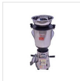
10 L Heavy Duty Mixer