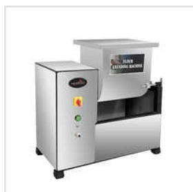
10 KG Square Type Flour Mixer