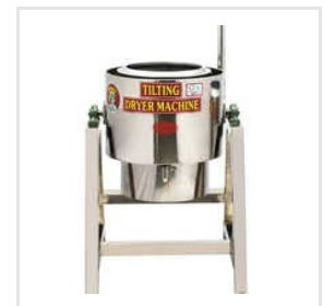
Tilting Dryer Machine