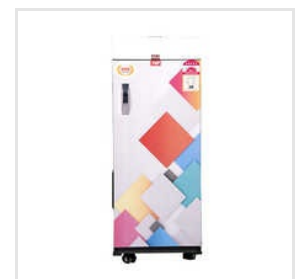
1HP Regular Flour Mill