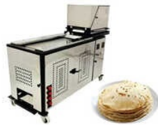
AUTOMATIC CHAPATI MAKING MACHINE