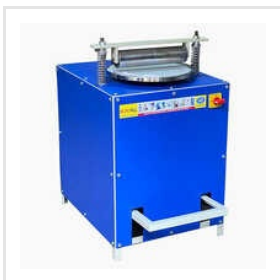
Mini Papad Machine