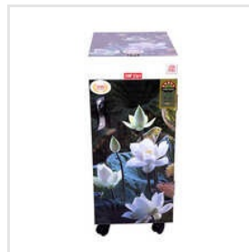
2HP 2 In 1 Domestic Flour Mill