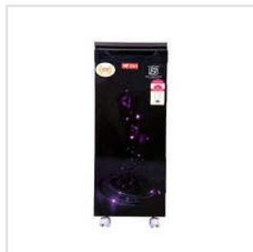
1HP 2 In 1 Flour Mill