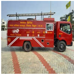
Four Wheeler Fire Brigade Vehicle