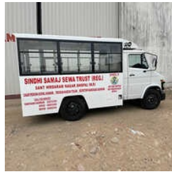
Four Wheeler Shav Vahan