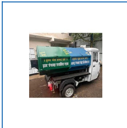
THREE WHEEL GARBAGE TIPPER