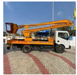
Hydraulic Sky Lift