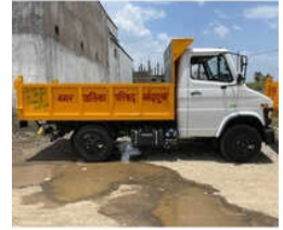
Big Garbage Tipper Dumper