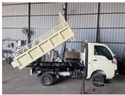
Open Garbage Tipper Dumper