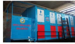
Portable Mobile Toilet