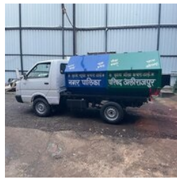
Hydraulic Garbage Tipper