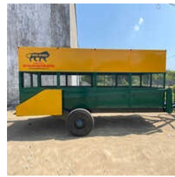
Cattle Catcher Hydraulic Trolley