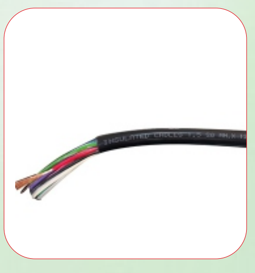
1.5 SQ MM 12 Core Round Cable