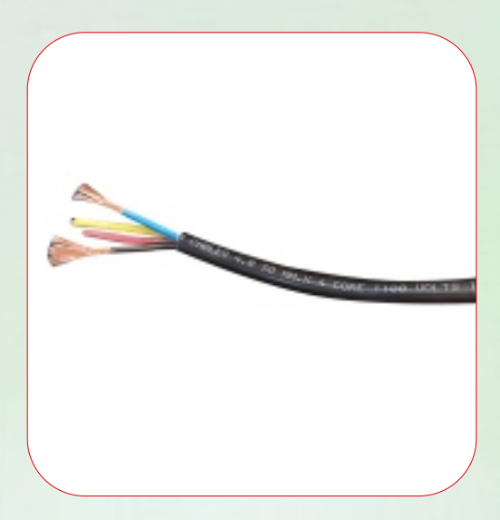
4 SQ MM 4 Core Cable