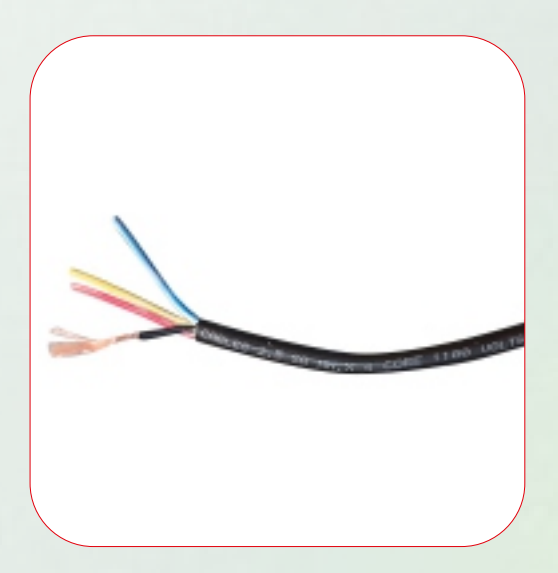
2.5 SQ MM 4 Industrial Core Cable