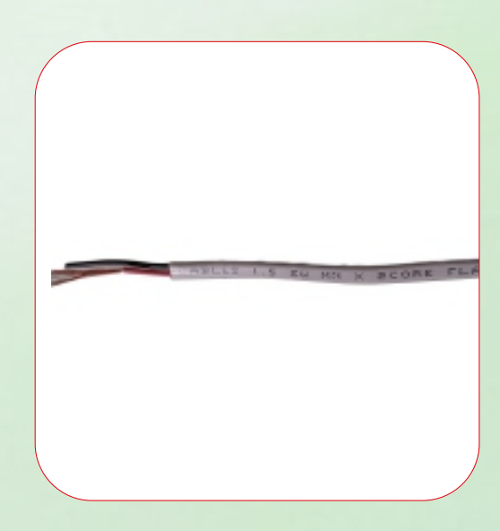
2.5 MM 3 Core Round Cable