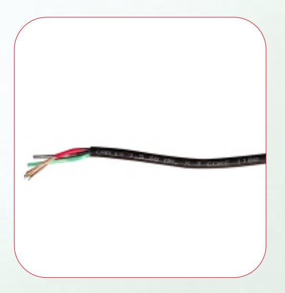
1.5 MM 3 Core Round Cable