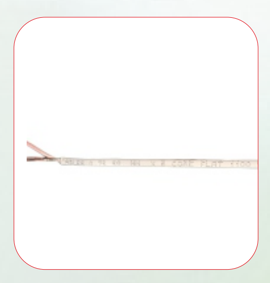
0.75 MM 2 Core Flat Cable