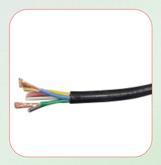
6 SQ MM 5 Core Copper Round Cable