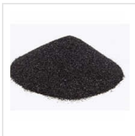
1100IV Activated Carbons Coconut