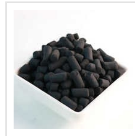
Activated Carbon Coconut Based Pellets