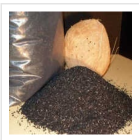
Granular Activated Carbon For Gold