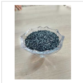
1mm Coconut Shell Activated Carbon