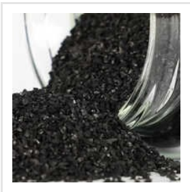
Activated Carbon Coconut Based