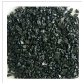
900IV Coal Based Activated Carbon