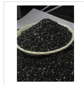
1050IV Activated Carbons Coconut