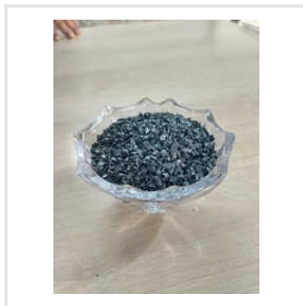
9.5mm Coconut Shell Activated Carbon