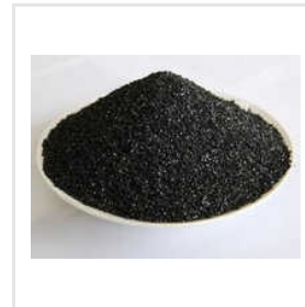
1100IV Coal Based Granular Activated