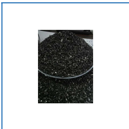
600IV ACTIVATED CARBON COCONUT BASED GRANULES

0.5 Mm Coconut Shell Activated Carbon, 100 TR Industrial Cooling Tower, 1000 LPH PVC Hydranautics Membranes, 1050IV Activated Carbons Coconut Based Granules, 1100IV Activated Carbons Coconut Based Granules, 1100IV Coal Based Granular Activated Carbon, 1200 LPH PVC Hydranautics Membranes, 1mm Coconut Shell Activated Carbon, 2mm Coconut Shell Activated Carbon, 300 LPH PVC Hydranautics Membranes, etc.