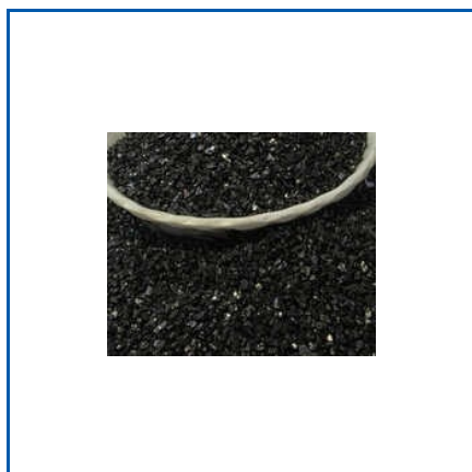
900IV ACTIVATED CARBONS COCONUT BASED GRANULES