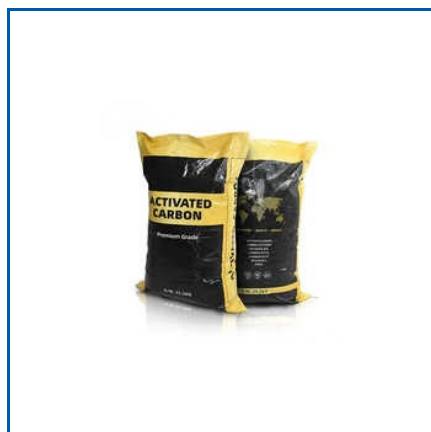
PREMIUM GRADE ACTIVATED CARBON