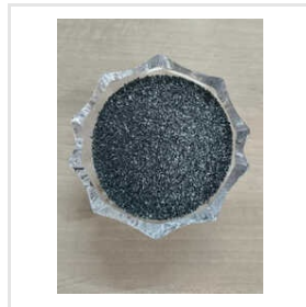
3mm Coconut Shell Activated Carbon