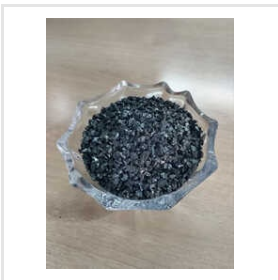
4mm Coconut Shell Activated Carbon