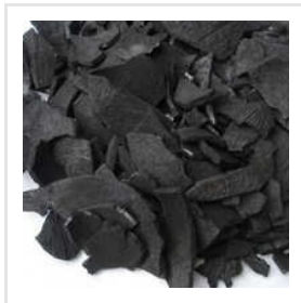
8mm Coconut Shell Activated Carbon