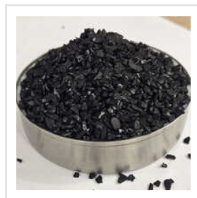
Coconut Activated Carbon