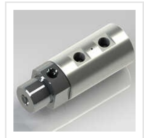
Four Port Hydraulic Rotary Union