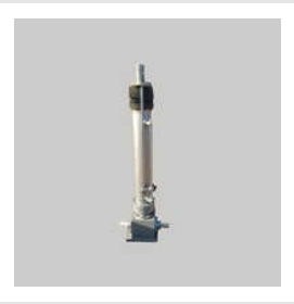
Bevel Gear Screw Type Linear Actuator