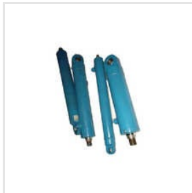
Industrial Hydraulic Cylinder