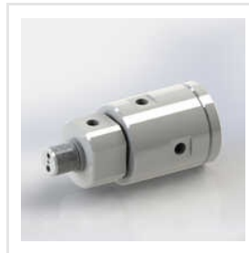
Multi Port Hydraulic Rotary Union