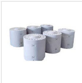
Rolling Mill Hydraulic Cylinder