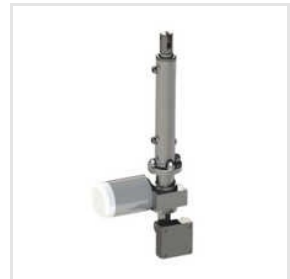
Ball Screw Type Worm Gear Linear Actuator