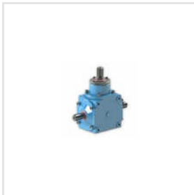
Bevel Gear Screw Jack