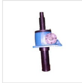
Worm Gear Screw Jack