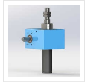
SWCJ Series Box Jack