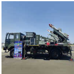
SAMAR-1 AIR DEFENCE SYSTEM GROUND LAUNCHER

Ball Screw Type Worm Gear Linear Actuator, Bevel Gear Screw Jack, Bevel Gear Screw Type Linear Actuator, Four Port Hydraulic Rotary Union, Hydro Power Plant Hydraulic Cylinder, Industrial Hydraulic Cylinder, Machined Screw Type Worm Gear Linear Actuator, Multi Port Hydraulic Rotary Union, Rolling Mill Hydraulic Cylinder, etc.