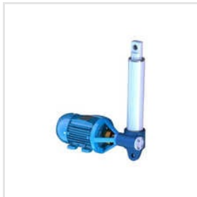
Machined Screw Type Worm Gear Linear