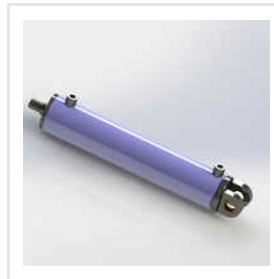
Hydro Power Plant Hydraulic Cylinder