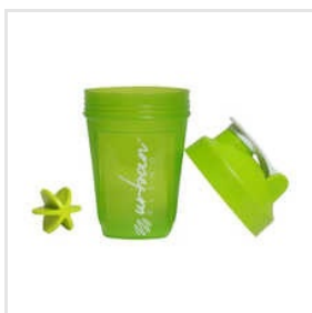
400ml Shaker Bottle