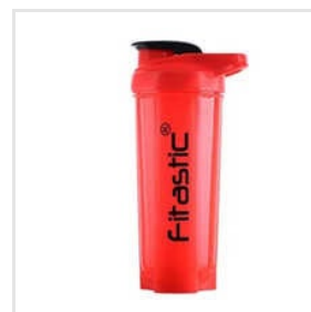
700ml Plastic Gym Shaker Bottles