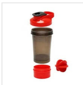
400ml Compartment Shaker Bottle