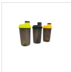
Tornado Shaker With Mixer Ball