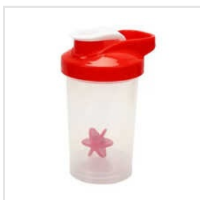
600ml Single Shaker