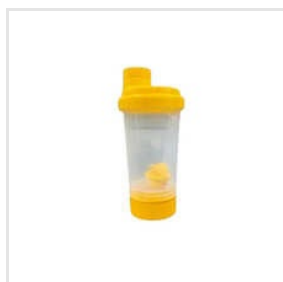
Shaker Bottle Double Compartment