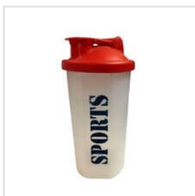
750ml Sport Shaker Bottle