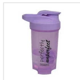
500 MI Shaker Bottle