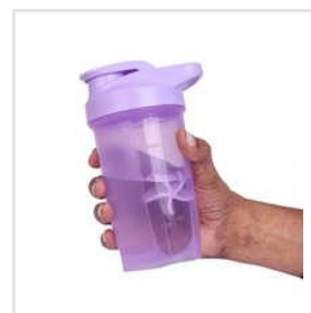
500ml Tansparent Plastic Gym Shaker