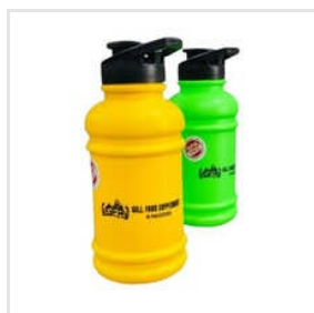
1Ltr Gallon Bottle