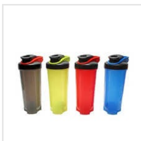
750ml Shaker Bottle