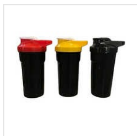
700ml New Shaker