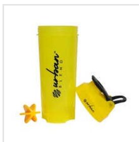
01_700 MI Typhoon Shaker