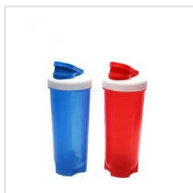
700ml Premium Shakers Bottle