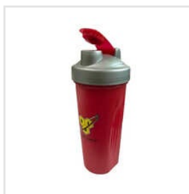
700ml Plastic Shaker Bottles