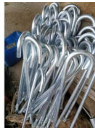
Zinc Plated Foundation Bolt