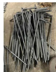
16MM MS FOUNDATION BOLT