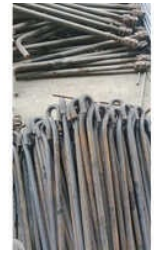
I Type Foundation Bolt