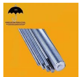
8 Mm GI Threaded Rod