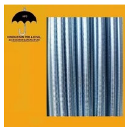
6 MM To 30 MM Full Threaded Rod