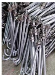
J TYPE FOUNDATION BOLTS