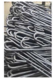
J Type Foundation Bolt