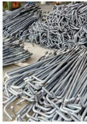
Zinc Plated L Type Foundation Bolt