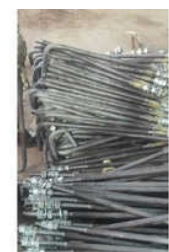
Anchor Fasteners Bolt