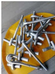
T Foundation Bolt