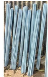
Industrial GI Threaded Rod