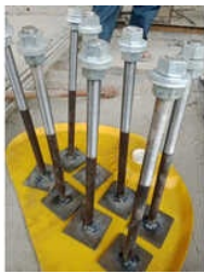
Bearing Plated Foundation Bolt