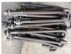
16MM FOUNDATION BOLT

10 mm GI Threaded Rod, 12 MM Mild Steel Sag Rod Black, 12 MM Sag Rod Black, 12 MM Sag Rod Zinc Plated, 12 MM to 16 MM Sag Rod, 12 Mm Zinc Plated Sag Rod, 12 mm GI Threaded Rod, 12 mm Mild Steel Coil, 16 MM Anchor Nut, 16 MM Sag Rod, 16 MM Tie Rod 200 MM to 7000 MM, 16 mm Brass Anchor Nut, 16 mm Mild Steel Construction Tie Rod, 16MM MS Foundation Bolt, 16Mm Foundation Bolt, etc.