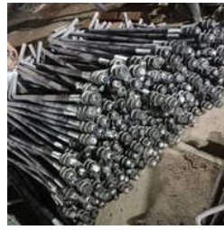
24 Mm MS Foundation Bolt