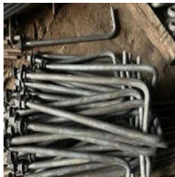
EN8D Material Foundation Bolt