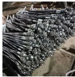
MS Foundation Bolt