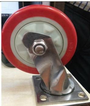
PU WHEELS WITH SS BRACKET