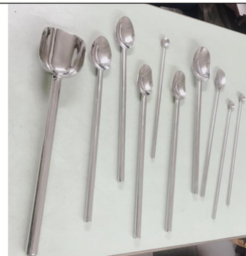
SS POWDER SPOONS