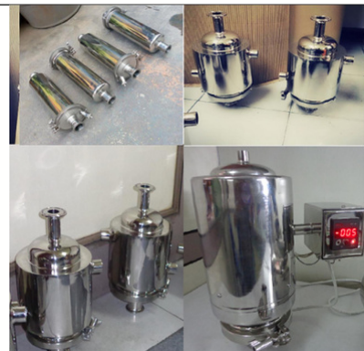
ELECTRIAL VENT HOUSING