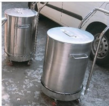
CONTAINERS WITH TROLLEY