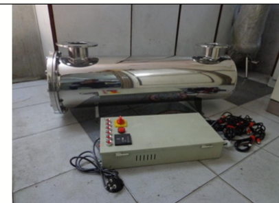
ULTRAVIOLET WATER STERILIZER (UV SYSTEM)