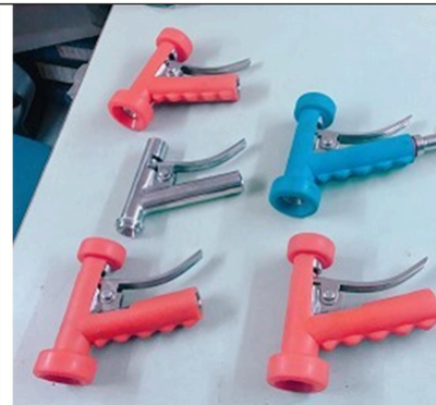
SS WATER SPRAY GUN