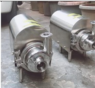
SS SANITARY PUMPS