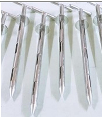
SS POWDER SAMPLERS