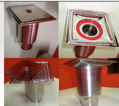
SS PHARMA FLOOR DRAIN TRAP