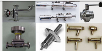
SS ZERO DEAD LEG VALVE, LOOP VALVE, DIAPHRAGM VALVE, SAMPLING VALVE , FLOW DIVERTER VALVE, BALL VALVE