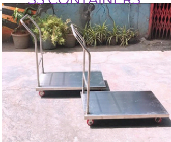
SS PLATFORM TROLLEY