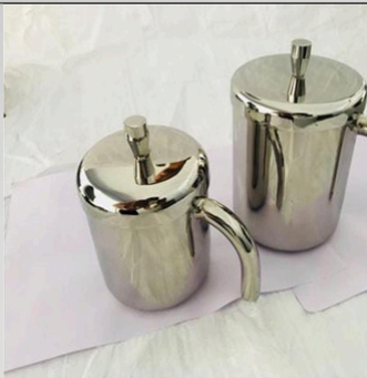
SS CONTAINOR WITH LID AND HANDLE