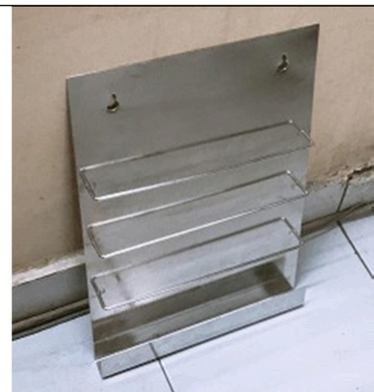
SS SOP STAND