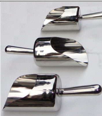
SS CLOSE TYPE SCOOP