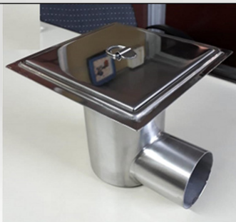
SS SIDE OUTLET GMP FLOOR DRAIN TRAP