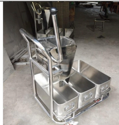
SS MOPPIG TROLLEY