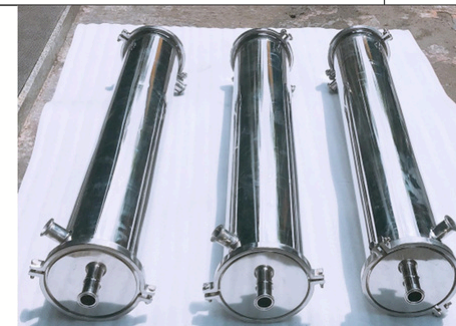
SS RO MEMBRANE HOUSING/ PRESSURE TUBES