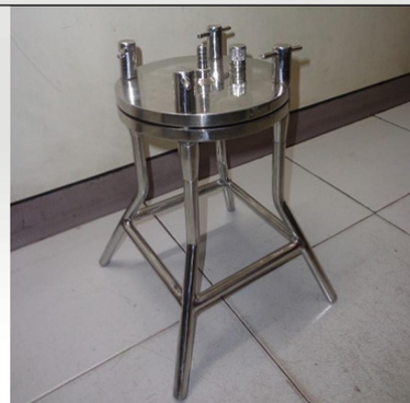
SS MEMBRANE HOLDER