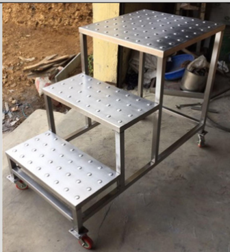
SS INDUSTRIAL STEP LADER