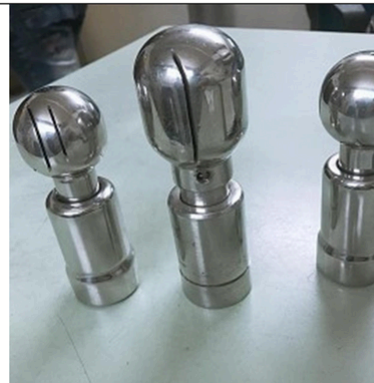
SS SPRAY BALLS