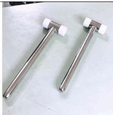
SS TEFLON HAMMER