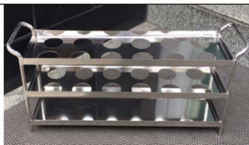
SS TEST TUBE STAND