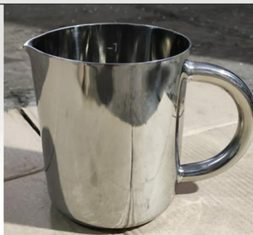
SS BEAKER JUG/JAR/MUG