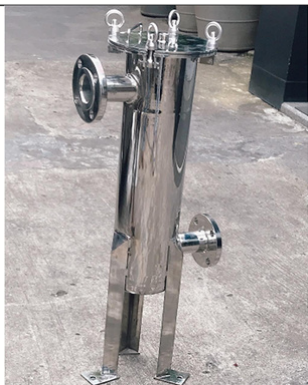
BAG FILTER HOUSING