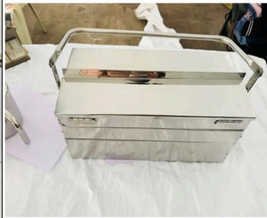
SS TOOL BOX