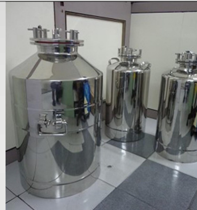
SS PRESSURE VESSELS