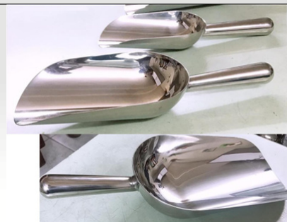
SS OPEN TYPE SCOOP