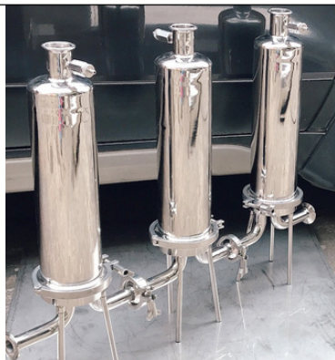
SS FILTER HOUSING