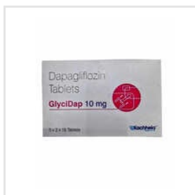
10mg Dapagliflozin Tablets