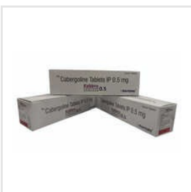
0.5mg Cabergoline Tablets IP