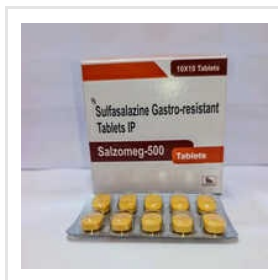
500mg Sulfasalazine Gastro Resistant