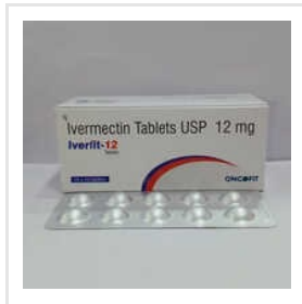
12mg Ivermectin Tablets USP