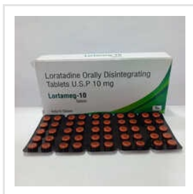
10mg Loratadine Orally Disintegrating Tablets