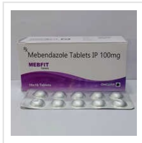
100mg Mebendazole Tablets IP