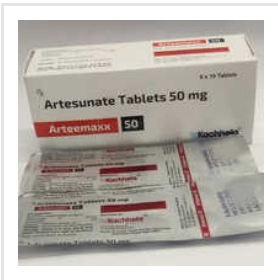
50mg Artesunate Tablets