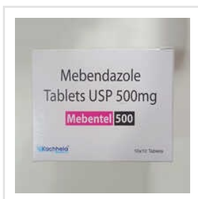
500mg Mebendazole Tablets