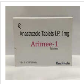
1mg Anastrozole Tablets