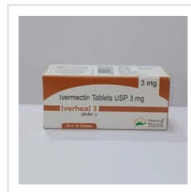
3mg Ivermectin Tablets USP