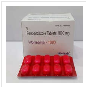
1000mg Fenbendazole Tablets