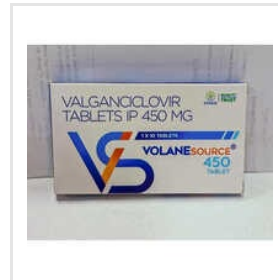
450mg Valganciclovir Tablets IP