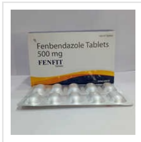
500mg Fenbendazole Tablets