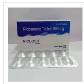
500mg Niclosamide Tablets