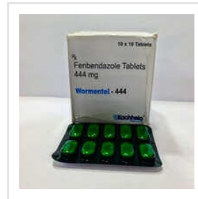
444mg Fenbendazole Tablets