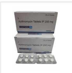
250mg Azithromycin Tablets IP