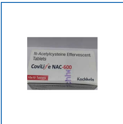
600MG N-ACETYLCYSTEINE EFFERVESCENT TABLETS