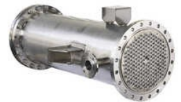
SS Heat Exchanger