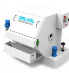
Compact Band Filter