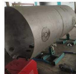
INDUSTRIAL AIR RECEIVER VESSEL