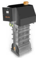
Vertical Type Candle Magnetic Separator