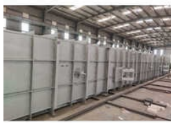
Mild Steel Furnace Casing