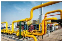
INDUSTRIAL CHEMICAL PLANTS PIPELINE

Belt Conveyors, Cartridge Filters, Centralize Chip Conveyor, Chip Wringer, Compact Band Filter, Heavy Duty SS Tank, Heavy Duty Water Treatment Tank, Industrial Agitator, Industrial Air Receiver Vessel, Industrial Chemical Plants Pipeline, Industrial Magnetic Chip Conveyor, Industrial Oil And Gas-Lubricant Pipeline, Industrial Oil Filtration System, Industrial SS Chain Conveyor, MS Bucket Elevator, etc.