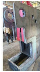
Mild Steel Heavy Duty Machine Base Frame