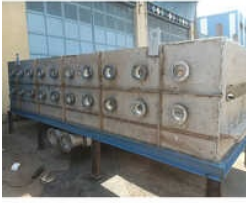
Heavy Duty SS Tank