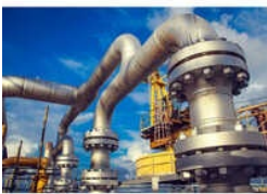
Industrial Oil And Gas-Lubricant Pipeline