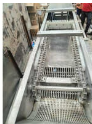
INDUSTRIAL SS CHAIN CONVEYOR