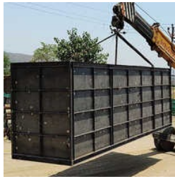
Heavy Duty Water Treatment Tank