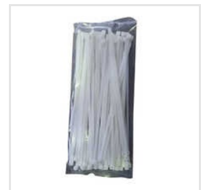
3.6 MM Nylon Cable Tie