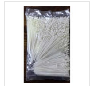
150x22 MM Nylon Cable Tie