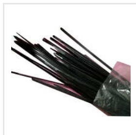
400x4.8 MM Black Cable Ties