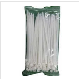
3 MM Nylon Self Locking Cable Tie