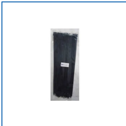
300X3.6 MM BLACK CABLE TIE