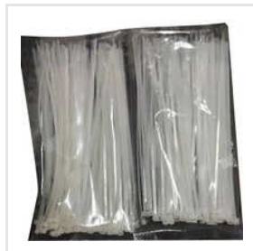
150x2.2 MM Nylon Cable Tie