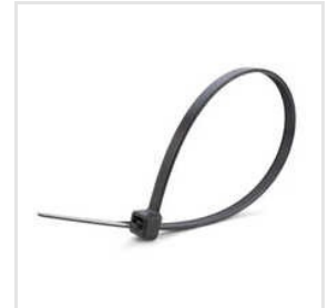
250x3.6 MM Nylon Black Cable Tie