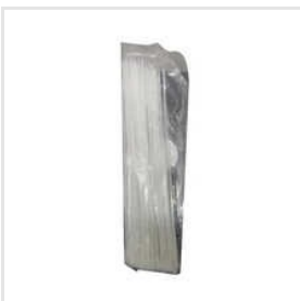
350x4.8 MM Nylon Cable Tie