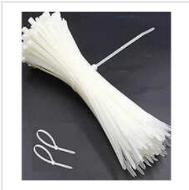
200x36 MM Nylon Black Cable Tie