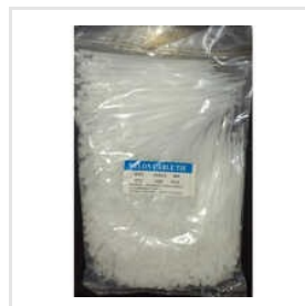
100x2 MM Nylon Cable Tie