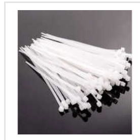
100x2 MM Nylon Self Locking Cable Tie