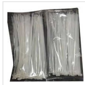
150x3.6 MM White Nylon Cable Tie