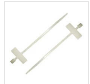
3.6 MM Nylon White Cable Tie