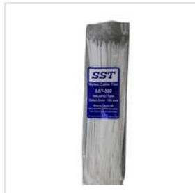
White Nylon Cable Tie