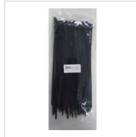
200x3.6 MM Nylon Black Cable Tie