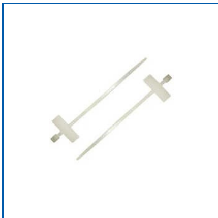
2.5 MM NYLON MARKER CABLE TIE

100 MM Cable Tie, 100 Mtr Uninyvin Cable, 100 Mtr White Uninyvin Electric Cable, 1000x12 MM Cable Tie, 100x2 MM Nylon Cable Tie, 100x2 MM Nylon Self Locking Cable Tie, 100x2.2 MM Nylon Cable Tie, 100x2.5 MM Cable Tie, 100x2.5 MM Nylon Cable Tie, 100x2.5 MM Plastic Cable Tie, 12 MM HST Heating Sleeve, 12 MM White Uninyvin Cable, 150x2.2 MM Nylon Cable Tie, 150x2.5 MM Cable Tie, 150x2.5 MM Nylon Cable Tie, etc.