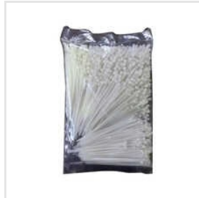
100x2.5 MM Nylon Cable Tie