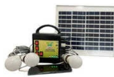
20W LED SOLAR MINI HOME LIGHTING SYSTEM