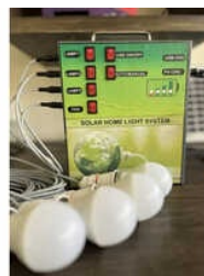
Solar Mini Inverter Home System