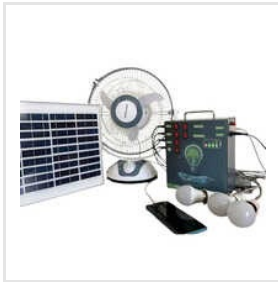
75W Solar Home Lighting Kit