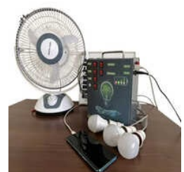
10W Home Solar Lighting System Kits