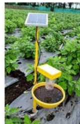
Solar Insect Traps For Agriculture