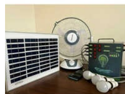
40W Semi Integrated Solar Home Lighting