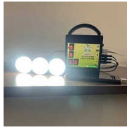
30W Mini Solar System For Home Lighting