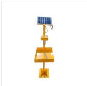
Solar LED Insect Light Trap With Stand