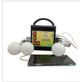
25W LED Solar Home Light Kit With Fan