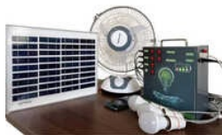
REVUP MINI SOLAR HOME LIGHT SYSTEMS

10W Home Solar Lighting System Kits, 12 Watt Solar LED Street Light For Outdoor, 18w Commercial Solar Home Light System, 20W LED Solar Mini Home Lighting System, 25W LED Solar Home Light Kit With Fan, 30W Mini Solar System for Home Lighting, 3W Solar Insect Trap, 40W Semi Integrated Solar Home Lighting System, etc.