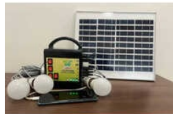
Small Solar Home Lighting System