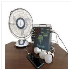
Solar Home Lighting Systems With Fan