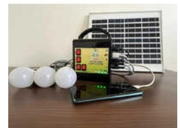
Solar Home Lighting Kit