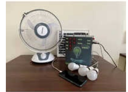
5W Revup LED Solar Home Lighting System