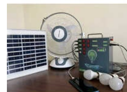
18W COMMERCIAL SOLAR HOME LIGHT SYSTEM