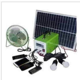
Commercial Solar Home Lighting System