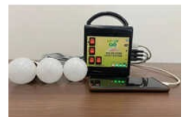
LED Solar Home Lighting System