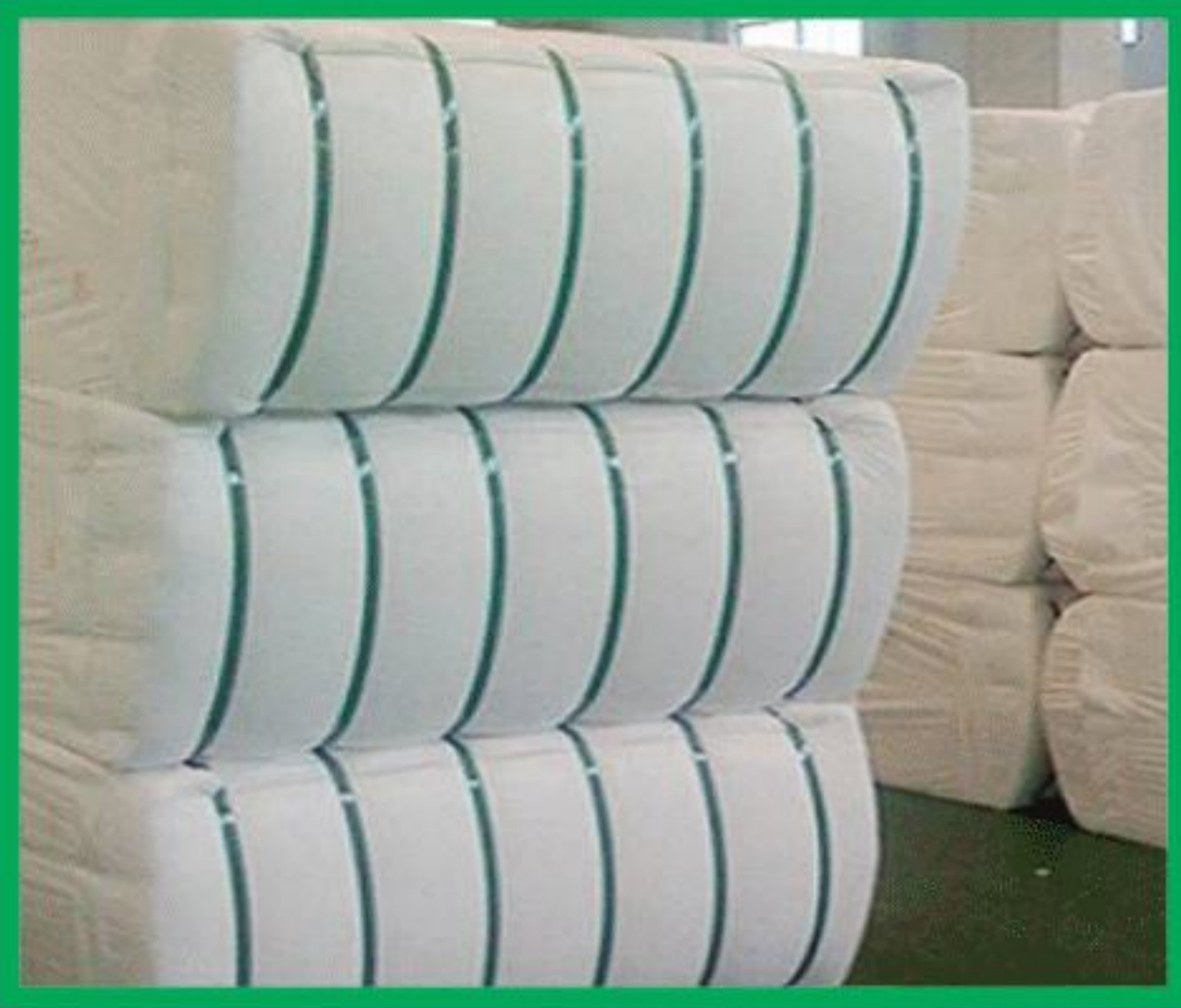
COTTON BALE PACKING