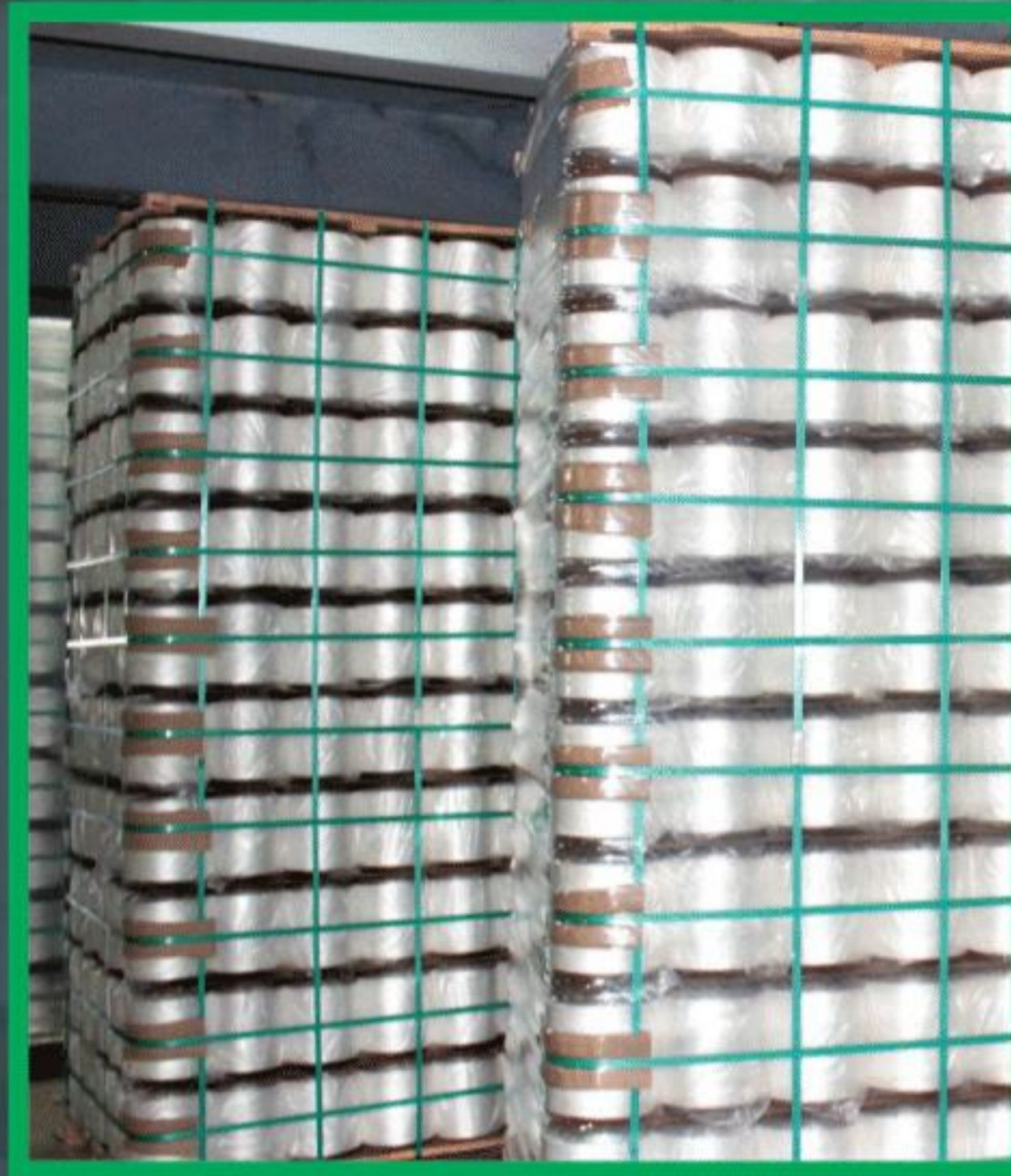
YARN ROLL PACKING