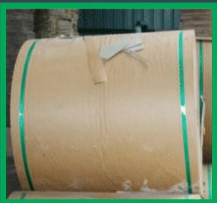
Paper Roll Packing

We "UV Polymers" are a prominent firm that is engaged in manufacturing and wholesaling of a wide range of Strapping Roll, Plastic Strap Roll, etc. Located in Shapar (Rajkot, Gujarat), we are Partnership firm and manufacture the offered products as per the set industry norms. Our valued clients can avail these products from us at reasonable rates. Under the headship of "Mr. Meet Vadaliya" (Partner), we have gained a remarkable and strong position in the market.