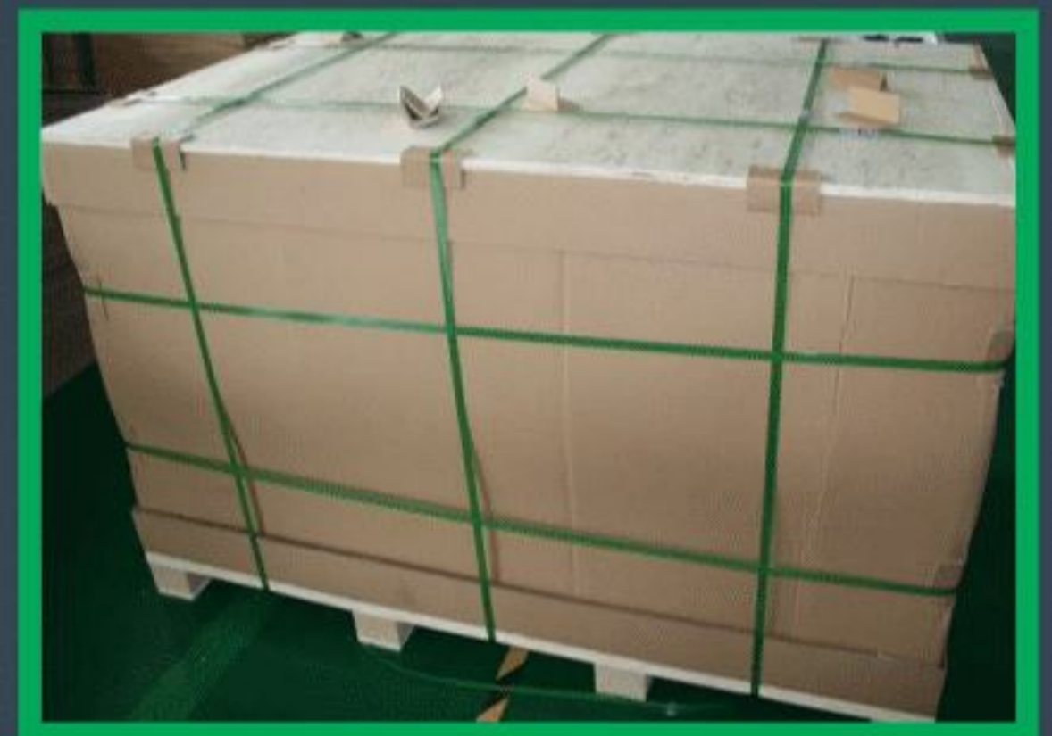
Solar Pannel Packing

Dear Sir, We are a manufacturer of PET (Polyester) Strap, which is mostly used in pallet packing and cotton or fiber pressing application. PET (Polyester) Strapping is best used for rigid loads and helps to absorb impact during transit. It's also a better alternative when you need higher initial tension to contain loads when compared to PP (Poly Propylene) strapping. PET strap is made from 100 percent recycled material. These straps are temperature-stable and guarantee high strength and elasticity for optimally securing loads. PET straps are used in an extremely diverse range of industries.