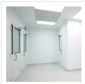
Cleanroom Wall Panels And Ceilings