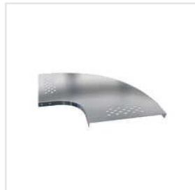
SS Perforated Cable Tray