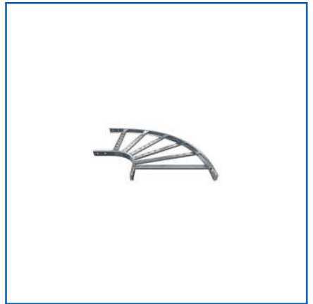
HORIZONTAL BEND CABLE TRAY