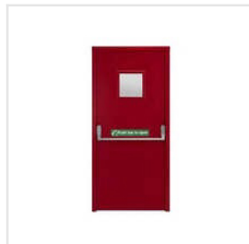
SS Emergency Door