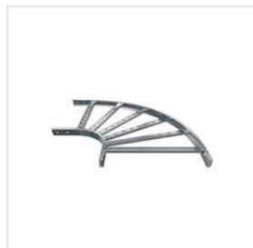
Horizontal Bend Cable Tray