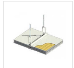
GI Pre Coated Ceiling