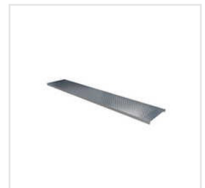
Pre Galvanized Rectangular Cable