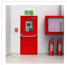
SS Fire Resistance Door