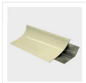
Two Piece Clean Room PVC Snap Coving