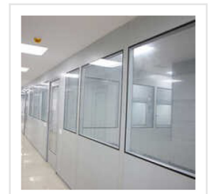
Clean Room View Panel