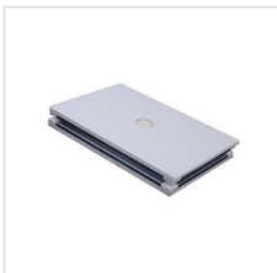
Highly Corrosive Resistance Panel