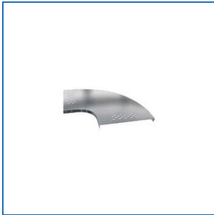
SS PERFORATED CABLE TRAY