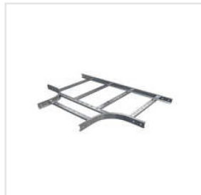
Equal T Ladder Cable Tray