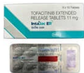
11 MG Tofacitinib Extended Release