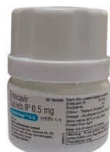
0.5 MG Entecavir Tablets IP