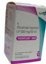
500 MG Rituximab Injection IP