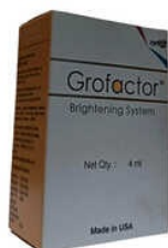
4 ML Brightening System Injection