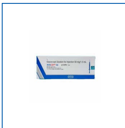
50 MG ETANERCEPT SOLUTION FOR INJECTION