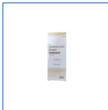
ZOLEDRONIC ACID INFUSION