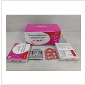
Combipack Of Mifepristone And