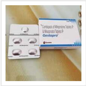
Combipack Of Mifepristone Tablets IP