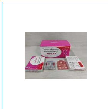
COMBIPACK OF MIFEPRISTONE AND MISOPROSTOL TABLETS IP