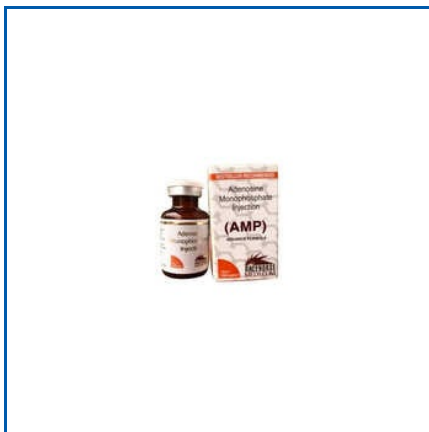
ADENOSINE MONOPHOSPHATE INJECTION

Adenosine Monophosphate Injection, Combipack Of Mifepristone And Misoprostol Tablets IP, Combipack Of Mifepristone Tablets IP And Misoprostol Tablets IP, Mifepristone Tablets IP And Misoprostol Tablets IP, etc.