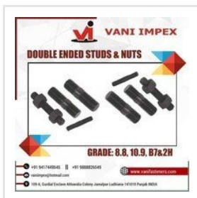
Double End Threaded Studs