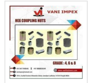
Hex Coupling Nuts