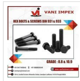
High Tensile Hex Bolts And Screws 8.8/10.9