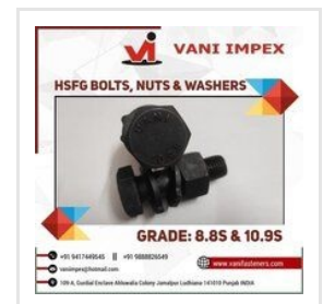
Hsfg Bolt Hsfg Nut Hsfg Washer Dti Washer