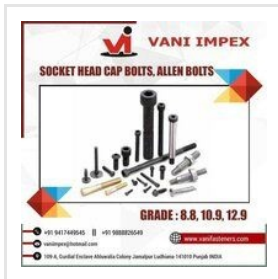
Socket Head Cap Bolt And Allen Screws