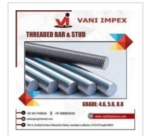
Fully Threaded Studs