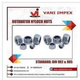
Self Locking And Nylon Insert Lock Nuts