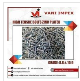
High Tensile Bolts Zinc Plated