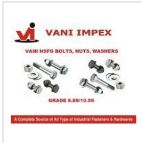
High Strength Friction Grip Bolts And Washer