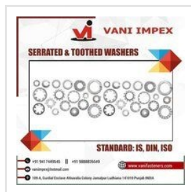
Serrated And Toothed Washers