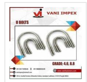
U Bolts Clamps