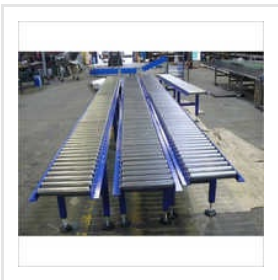
Gravity Roller Conveyor