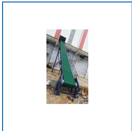
TROUGH BELT CONVEYOR