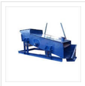
Single Deck Vibrating Screen