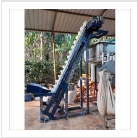
Industrial Bucket Elevator