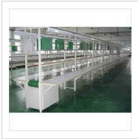
Assembly Line Belt Conveyor