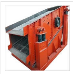
Eccentric Motion Vibrating Screen