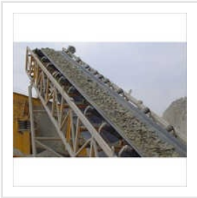
Bulk Handling Conveyor