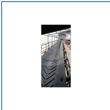
INDUSTRIAL RUBBER BELT CONVEYOR