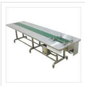
Packing Belt Conveyor