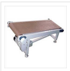
Flexible Slat Conveyor