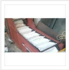
Continuous Bucket Elevator