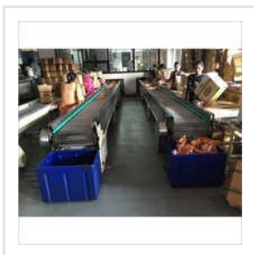
Food Handling Conveyor