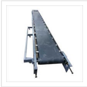
Rubber Belt Conveyor