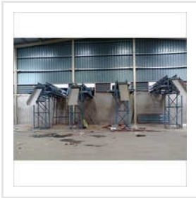
Industrial Belt Conveyor