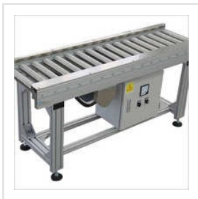
Motorized Roller Conveyor