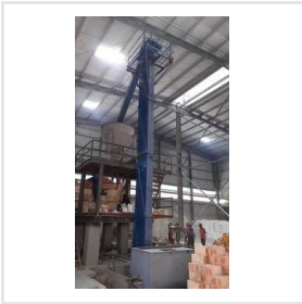
Centrifugal Bucket Elevator