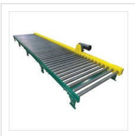
Stainless Steel Roller Conveyor