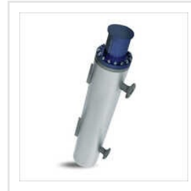
Thermic Fluid Electrical Heating System