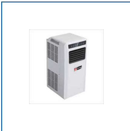
ROOM AIR DISINFECTION SYSTEM

Air Cooled Process Chiller, Air Cooling Unit, Bio Safety Air Conditioner, Cascade Chiller, Commercial Air Handling Units, Condensing Unit, Daikin Air Cooled Inverter Chillers, Daikin Air Cooled Screw Chillers, Daikin Air-Cooled Scroll Chillers, Daikin Water Cooled Screw Chillers, Daikin Water Cooled Scroll Chillers, Duct Mounted UVGI System, Flame And Explosion Proof Chillers, Flame Proof Split AC, Flame Proof Window AC, etc.