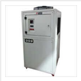
Industrial Chemical Recovery Unit