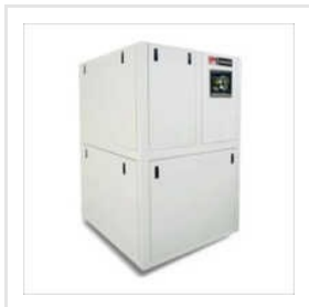
Heating Cooling Fluid Chillers