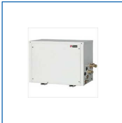
WATER COOLED SPLIT AIR CONDITIONER