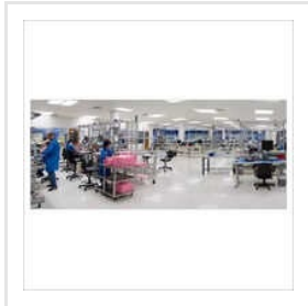
Bio Safety Air Conditioner