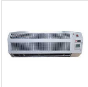
Flame Proof Split AC