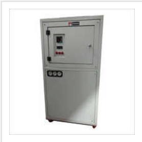
Pragmatic Process Chillers