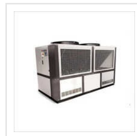
Heat Recovery Chillers