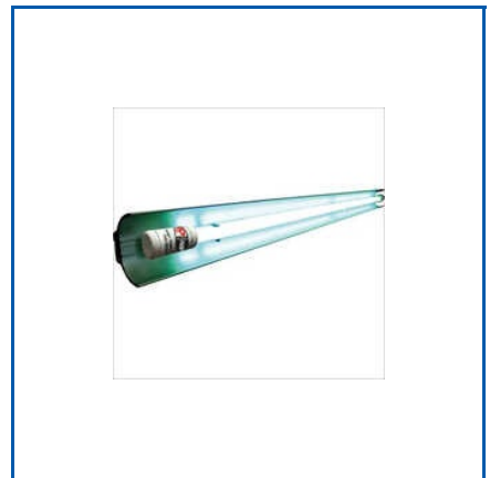
UVGI SYSTEM FOR AHU SURFACE CLEANING AND AIR DISINFECTION