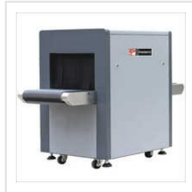
UVGI Material Disinfection Tunnel