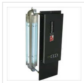
Duct Mounted UVGI System