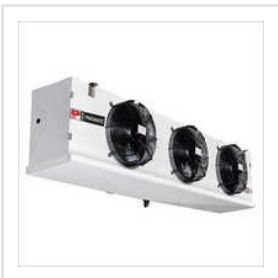
Industrial Cold Room Equipments