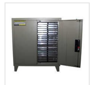
SSI-1030 MICROSLIDE CABINET -