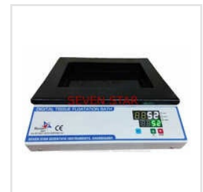
SSI-1026 TISSUE FLOTATION BATH -