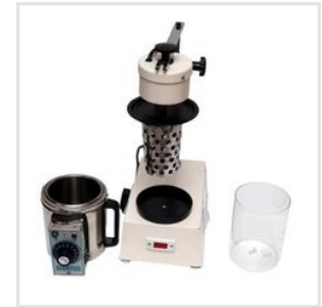
SSI-1001 TISSUE PROCESSING UNIT-