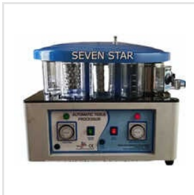
SSI-1002 AUTOMATIC TISSUE PROCESSOR-