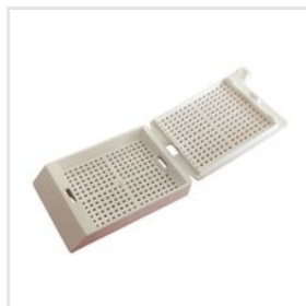
SSI-1006-103 POM Tissue Embedded