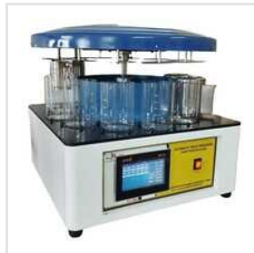
SSI-1003 AUTOMATIC TISSUE PROCESSOR-