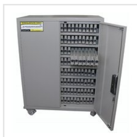
SSI-1029 MICROSLIDE CABINET - (CLOSED