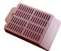
SSI-1006-101 WHITE TISSUE EMBEDDED CASSETTE