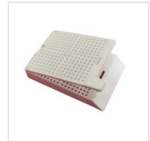
SSI-1006-106 Rectangular Tissue