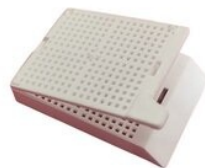
SSI-1006-105 TISSUE EMBEDDED CASSETTE FOR LAB