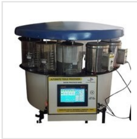
SSI-1004 AUTOMATIC TISSUE PROCESSOR -