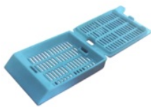
SSI-1006-104 POM TISSUE EMBEDDED CASSETTE

SSI- 1010 Rotary Microtome – Lipshaw Type, SSI- 1036 Grossing Workstation Ex., SSI-1001 Tissue Processing Unit- Single Unit, SSI-1002 Automatic Tissue Processor- Pin Type, SSI-1003 Automatic Tissue Processor- Touch Screen, SSI-1004 Automatic Tissue Processor – Touch Screen (advance), SSI-1005 S. S. Tissue Capsule with Sliding Covers, Etc.