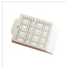
SSI-1006-102 Tissue Embedded Cassette