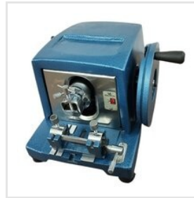
SSI-1009 ROTARY MICROTOME - A.O.