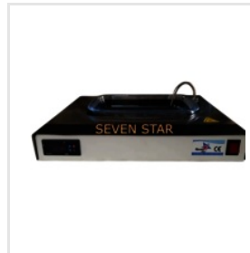
SSI-1028 TISSUE FLOTATION BATH WITH