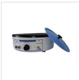
SSI-1025 TISSUE FLOTATION BATH