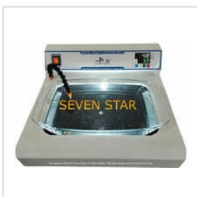
SSI-1027 TISSUE FLOTATION BATH WITH