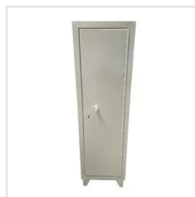
SSI-1031 MICROSLIDE CABINET - (FLAT