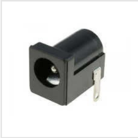
DC Power Socket