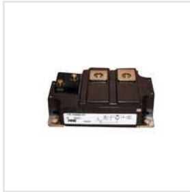
CM400HU-24F IGBT Modules Electronic