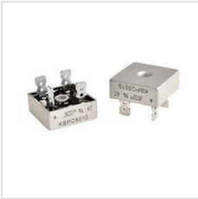
Electronic Bridge Rectifier