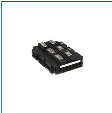
ELECTRIC IGBTs MODULES

1K 10KV Ceramic Capacitor, 3 Pin Power Socket, 3386W-1-104 Potentiometers, 6MBI75UC-120 FUJI IGBT Modules, Alcon Capacitor, Amp Bridge Rectifier, CM300DY-24H IGBT Modules, CM400HU-24F IGBT Modules Electronic Transistor, CM600HA-24A IGBT Module, DC Power Socket, DF Bridge Rectifier, Electric DIP Switch, Electric Bridge Rectifier, Electric IGBTs Modules, Electric Power Cord, etc.