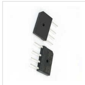
Electric Bridge Rectifier