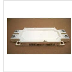
SEMIX703GB126V1 IGBT Module