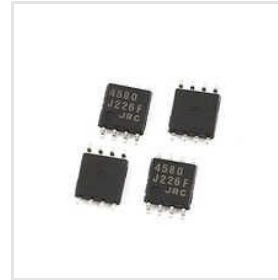
SMD IC Transistors