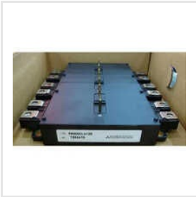
SEMIX503GB126V1 IGBT Module