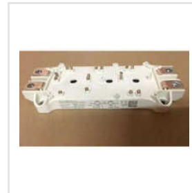
SEMIX353GB126V1 IGBT Module