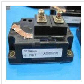
CM600HA-24A IGBT Module