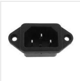
Female Socket Power