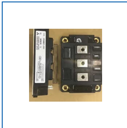
CM300DY-24H IGBT MODULES