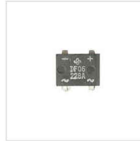
DF Bridge Rectifier