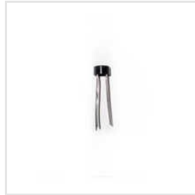
Amp Bridge Rectifier