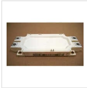
FF600R12ME4 IGBT Module