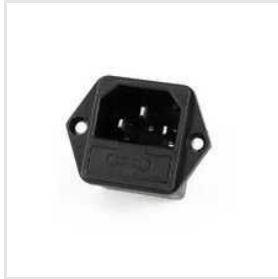
3 Pin Power Socket